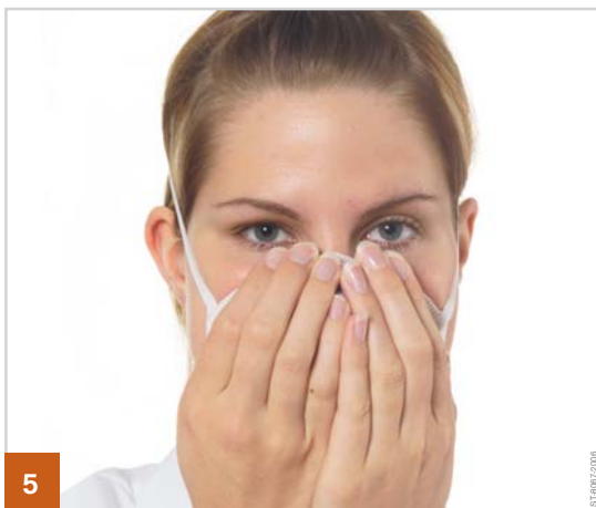
5 Cover the mask with both hands and exhale. The half-mask should inflate slightly. If any air escapes at the sides of the mask, readjust the mask until it fits properly and ensure that the nose clip is positioned correctly on your nose.