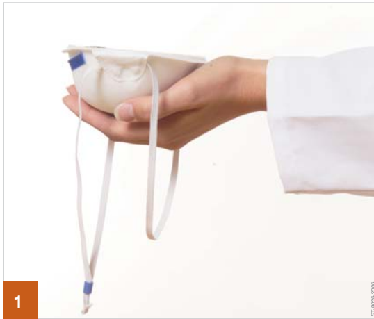
1 Hold the mask in your hand with the head straps hanging down.