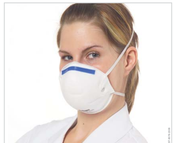
Ready for use.