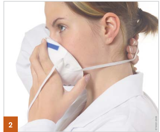
2 Position the mask under your chin and over your nose and slip the short strap over your head to the back of your neck.