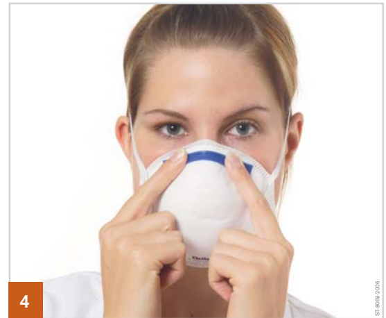
4 Adjust the nose clip to minimize leakage.