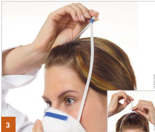
3 Pull the longer strap into position at the back of your head. Slide the adjustment knob toward your head for an optimal fit.