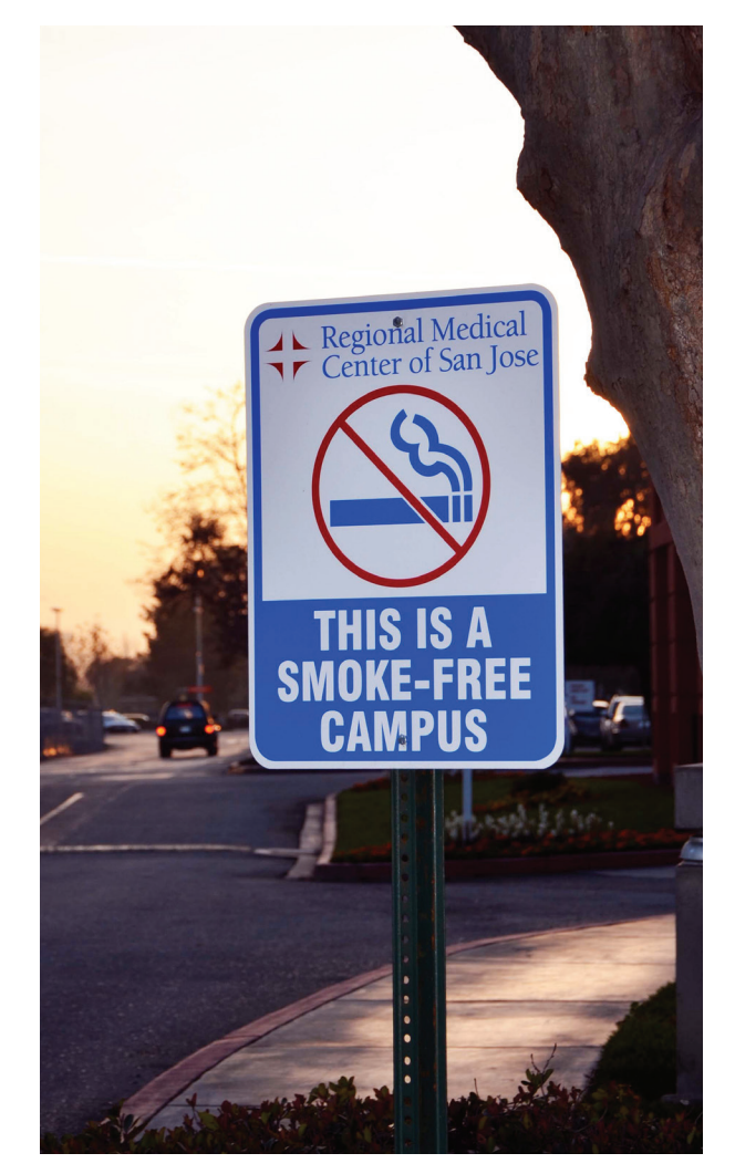
Smoke-free sign on medical center campus in Santa Clara County, CA.

As a result of the Tobacco Prevention Program's partnership efforts, cessation services are now available to some of the most vulnerable populations