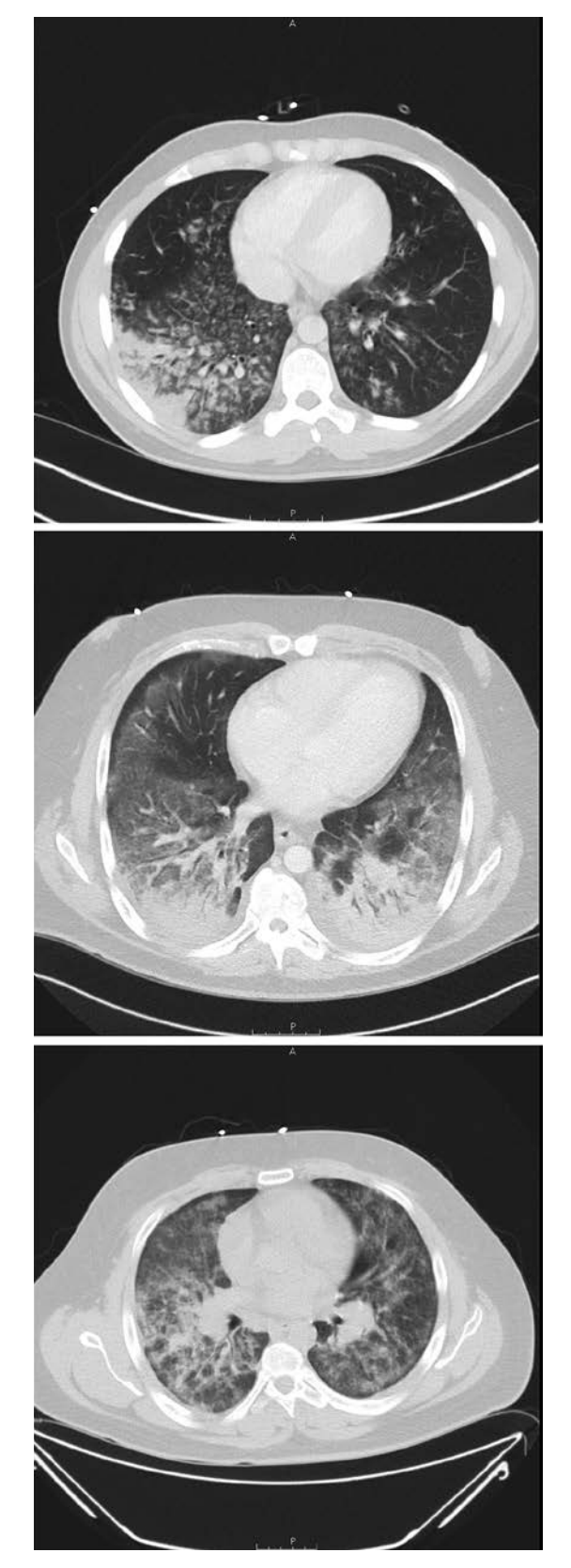
FIGURE 1. Computerized tomography images showing diffuse lung infiltrates in three patients with e-cigarette-associated severe lung disease — North Carolina, July–August 2019