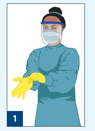
Make sure to wear required PPE.

Proceed with only one of the following: 2a or 2b or 2c