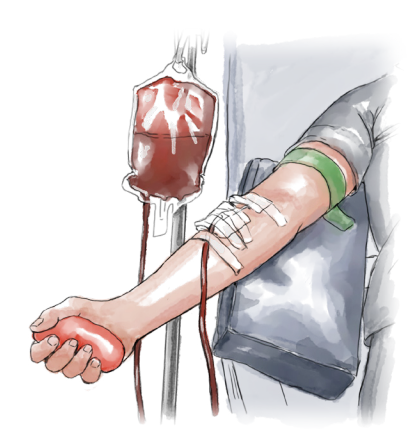
Through blood transfusion Zika virus may be spread through blood transfusion.