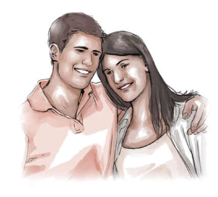
Through sex Zika virus can be passed through sex from a person who has Zika to his or her sex partners.