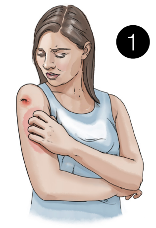
A mosquito bites a person infected with Zika virus