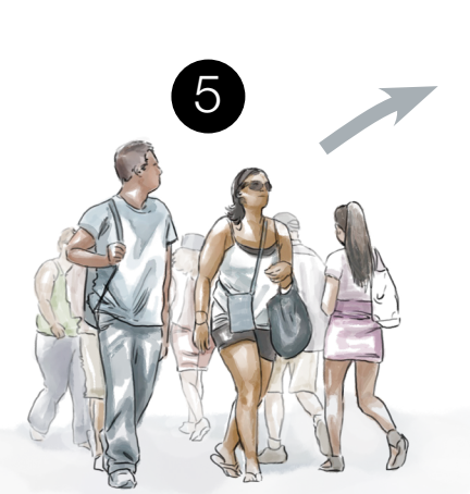
More members of the community become infected when they are bitten by those infected mosquitoes