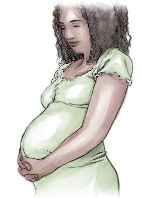
During pregnancy A pregnant woman can pass Zika virus to her fetus during pregnancy. Zika infection during pregnancy can cause serious birth defects and is associated with other pregnancy problems.