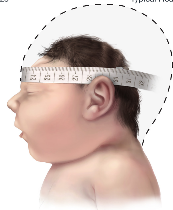
Baby with Severe Microcephaly