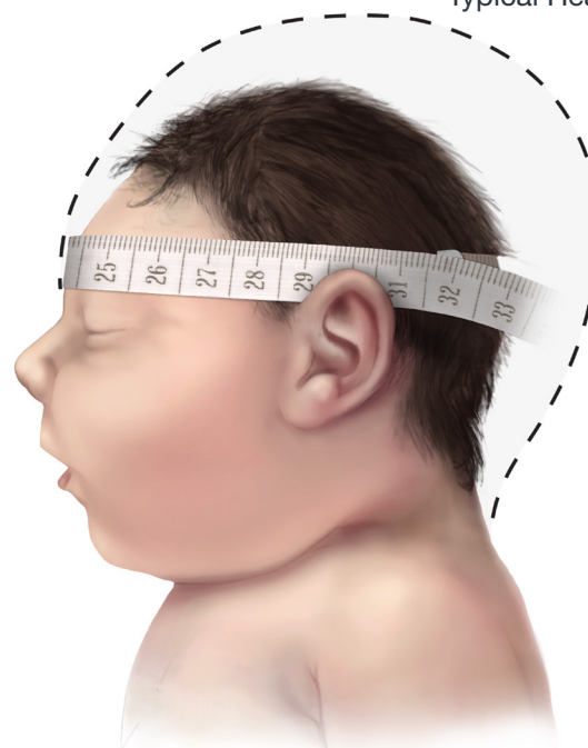
Baby with Microcephaly