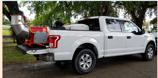
Mosquito control truck used for spraying larvicides

During an outbreak, local government departments and mosquito control districts take the lead for large-scale mosquito control activities to immediately kill larvae that hatch from eggs. Depending on the size of the outbreak, larvicides may be applied using handheld sprayers, trucks, or airplanes.