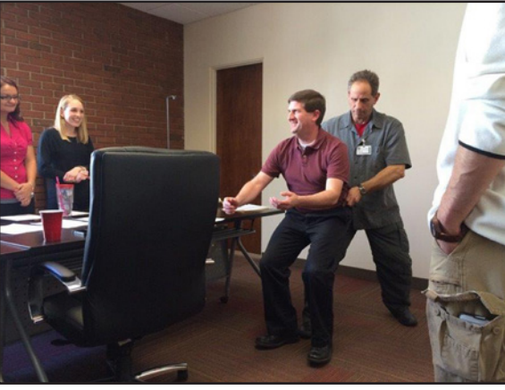
SEPI conducts a lunch and learn session on ergonomics for employees.