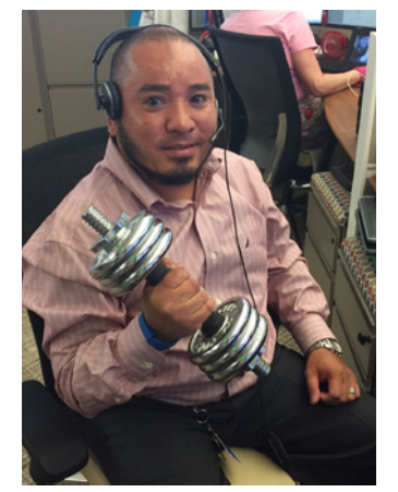
A MagMutual employee exercises at his desk.