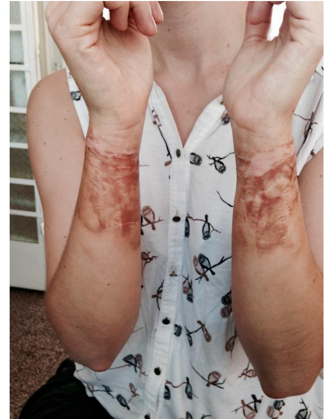
Chlorine burn from dunking hands with gloves on in bucket –unknown concentration in bucket (Sierra Leone 2014 Ebola Virus Disease outbreak)