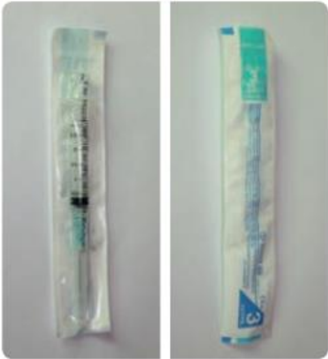
New and undamaged packaging