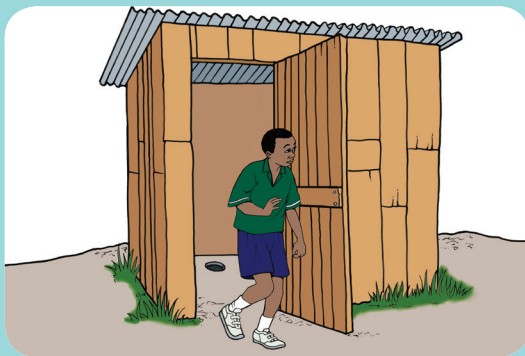
After using the toilet or helping a child use the toilet