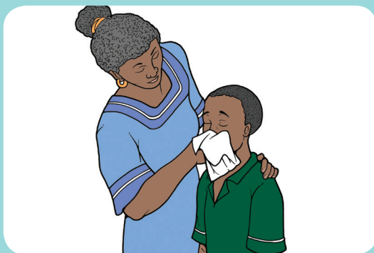
After touching body fluids: pee, poop, vomit, tears, snot, spit, blood, or sweat

If you feel sick, call 117 Together, we can get to zero!