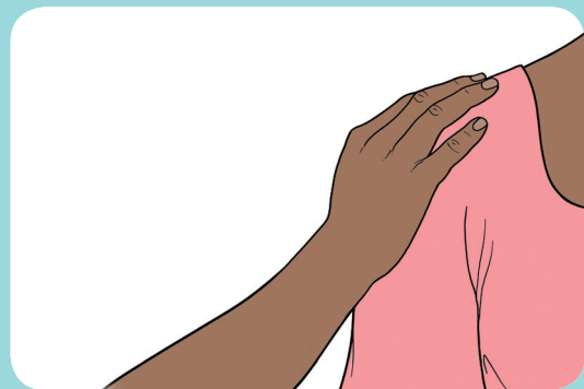
After touching another person