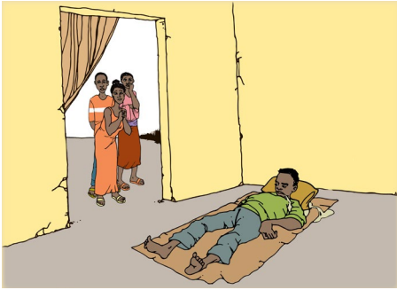
Do NOT touch sick people, or their blood or other body fluids.