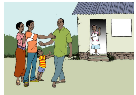
Ebola survivors are safe to be around. Support them in your community.