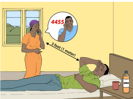
Call 4455 in Liberia if you have symptoms of Ebola.