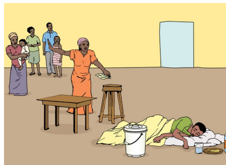
Separate sick family members.