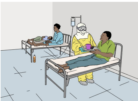
Health workers in the treatment center are there to help you.