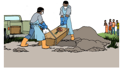
Bury all dead bodies safely.