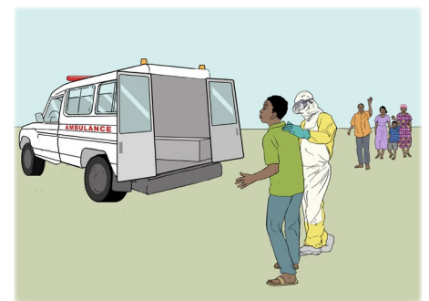
Get care early if you develop symptoms.