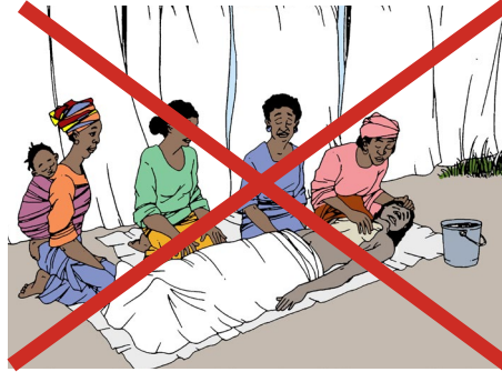
Don't touch the body of someone who has died of Ebola.