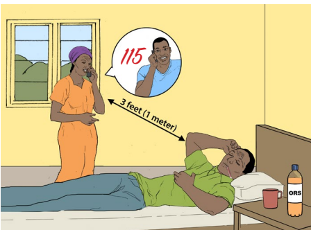
Call 115 in Guinea if you have symptoms of Ebola.