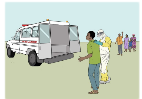
Get care early if you develop symptoms.