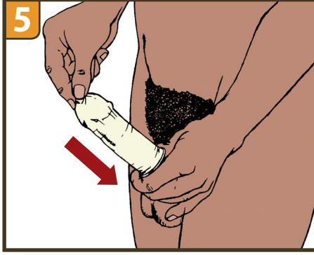
Unroll the condom all the way down the penis.