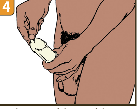
Pinch air out of the tip of the condom.