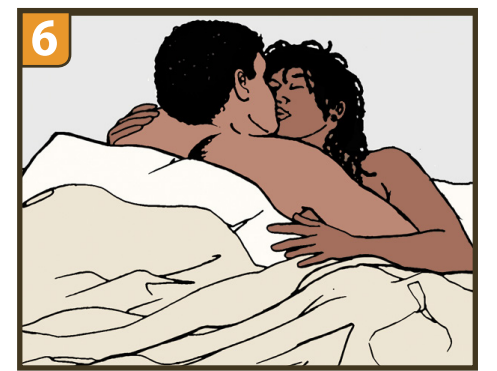
Use a condom every time you do man woman business.