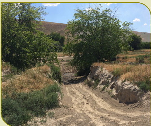
Coccidioides lives in dry, dusty soil. It was recently found in south-central Washington.

Scientists believed that Coccidioides only lived in the Southwestern United States and parts of Latin America until discovering it in south-central Washington in 2013 after several residents developed Valley fever without recent travel to areas where the fungus is known to live. Samples from one patient and soil from the suspected exposure site were analyzed using a laboratory technique called whole genome sequencing and were found to be identical, proving that the infection was acquired in Washington.