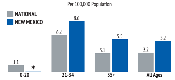
ALCOHOL-IMPAIRED DRIVING DEATH RATES BY AGE

Deaths in crashes involving a driver with BAC \geq 0.08%. * Fatality rates based on fewer than 20 deaths are suppressed.