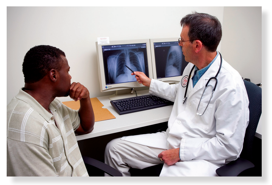
A chest x-ray may show if you have TB disease.