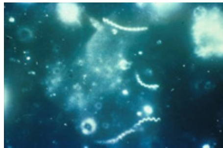
Darkfield micrograph of Treponema pallidum .

Yes, syphilis can be cured with the right antibiotics from your health care provider. However, treatment might not undo any damage that the infection has already done.