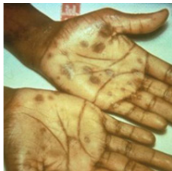
Secondary rash from syphilis on palms of hands.

Symptoms of syphilis in adults vary by stage: