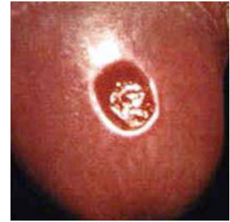
Example of a primary syphilis sore.