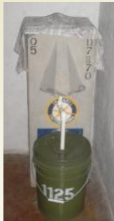
Locally-made concrete slow sand filter Pure Water for the World

There are several training centers that promote the SSF. The NGOs Centre for Affordable Water and Sanitation Technology (CAWST) and BushProof both offer training, implementation manuals, and assistance to organizations interested in starting SSF programs.