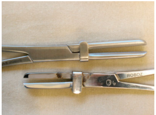
Figure 4. Tube occluding clamps after protocol C, soaking five times for 1 h in chlorine bleach. The upper instrument was made in Germany, the lower instrument in Pakistan.

Protocol C. Undiluted household bleach (5.25% or 6% sodium hypochlorite) caused pitting and other evidence of corrosion to many of the instruments, most notably at welds and carbide jaws, as shown on instrument 3 in Figure 1, and gold-coated handles as shown in Figure 3. Some of the Pakistani instruments showed no damage and some of the Roboz instruments did show damage as shown in Figure 4. Pitting on the inexpensive instruments was typically seen