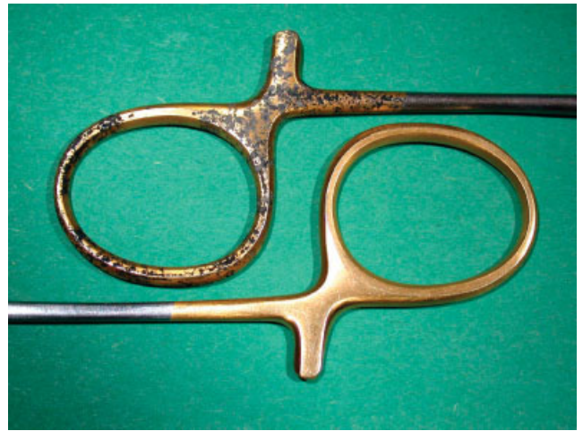
Figure 3. The gold-plated finger holes of the same needle holders shown in Figure 1. The upper instrument shows severe corrosive attack to the gold plating due to the bleach. The lower instrument shows no attack to the gold and only minimal discoloration of the stainless steel after autoclaving in sodium hydroxide.

Protocol B. The five 1-h soaks in 1N NaOH caused corrosion on the carbon-steel tweezers and the steel spring on the Agricola tissue spreader and a slight discoloration of the titanium tweezers. There was no apparent damage to the other Roboz surgical instruments and they were bright and shiny. Some of the inexpensive clamps from VWR were slightly discolored, but this could easily be wiped off.