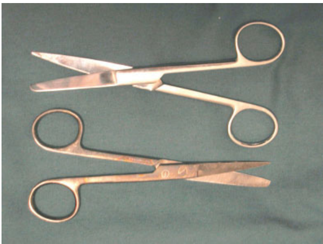
Figure 2. Surgical scissors after protocol A, autoclaving five times in 1N sodium hydroxide for 1 h. The upper instrument was made in Germany, the lower instrument in Pakistan.

Protocol A. In general, autoclaving in NaOH more than once caused darkening of the instruments, especially in the closed portions of box joints, as shown with the instrument labeled 1 in Figure 1. Some of the Pakistani stainless-steel instruments became darkened as shown in Figure 2, while the titanium tweezers became very dark. This discoloration could not be scrubbed or easily polished off. There did not seem to be any change in function, and tissue or blood did not accumulate on the dark spots or the rainbow areas. Routine cleaning did not remove the darkening.