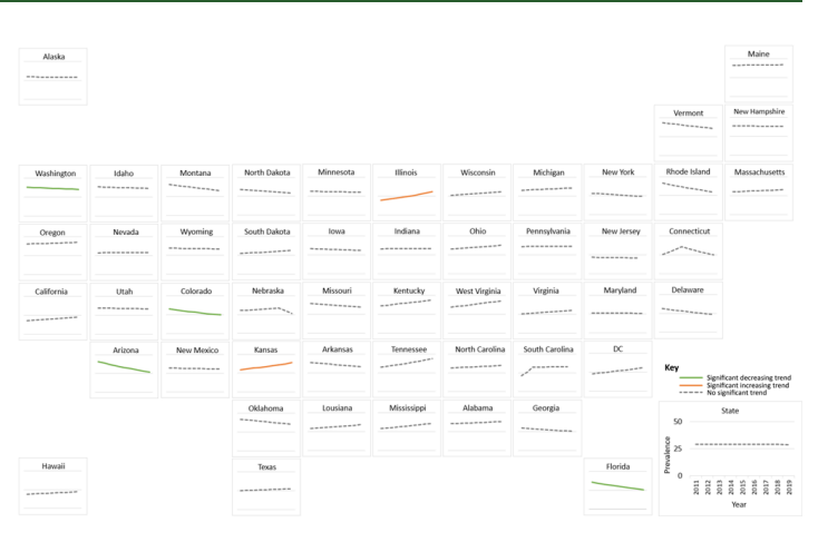
Figure 3. State-specific trends in annual age-adjusted depression prevalence among US adults with diabetes, 2011–2019. Trend lines for depression prevalence, as estimated by joinpoint regression, are shown for each state. Abbreviation: DC, District of Columbia.