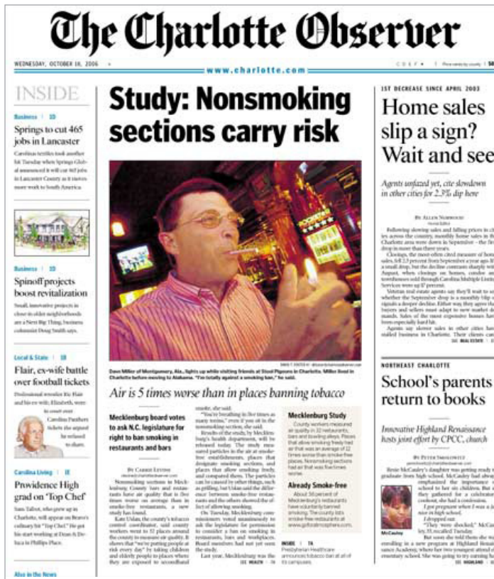
Figure 2. Front page of the Charlotte Observer , October 18, 2006, an example of media activity generated by the North Carolina Indoor Air Study, 2005-2007.

control partners to 4 local boards of health, the local health director's liaison committee of the state health department, 5 local health directors, and 5 tobacco control coalitions. Presentations were also made to statewide health coalitions such as the North Carolina Alliance for Health and legislative committees such as the Justus-Warren Heart Disease and Stroke Prevention Task Force.