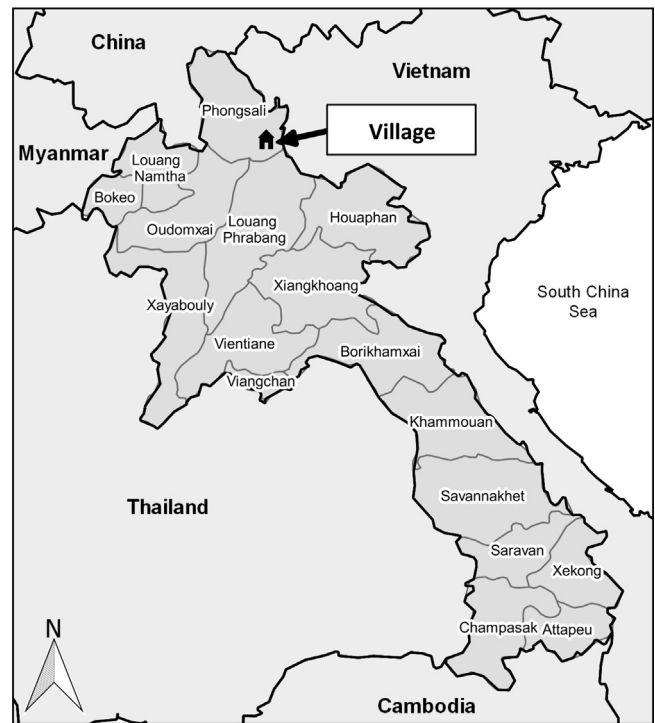
Fig. 1. Village location.

The study village is situated in the northernmost Lao PDR province of Phongsaly, in Mai District bordering Vietnam (Fig. 1).