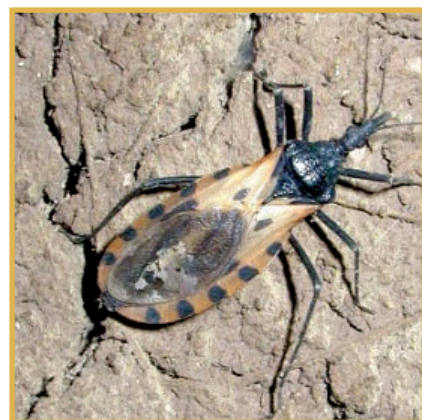
Photo of a triatomine bug which if infected can transmit T. cruzi .

CDC provides extensive support to physicians and patients nationwide, including education about the disease, patient risk factors for infection, diagnostic testing, recommendations for appropriate evaluation and treatment, and the release of medication. Treatment for Chagas disease is available. In the United States, antiparasitic drugs are available only from CDC for use under investigational protocols for compassionate treatment. CDC has released medication for treatment of more than 350 patients since 2000, the majority of those drug releases in the past six years. This recent, substantial increase in requests for treatment may reflect growing recognition and increasing frequency of testing for Chagas disease in the United States.