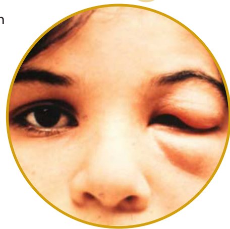
Acute Chagas disease in a young child. Romaña's sign is present. Brazil, 1991.

For more information on Chagas disease, please visit http://www.cdc.gov/parasites/chagas (English) http://www.cdc.gov/parasites/chagas/es/ (Spanish) or call 1-800-CDC-INFO