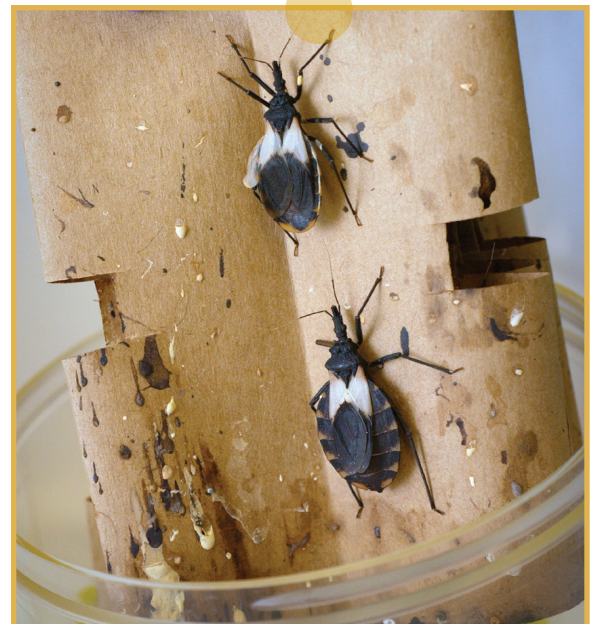
Photo of a triatomine bug which if infected can transmit T. cruzi .