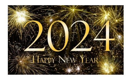
December 22, 2023

** The next DSLR Friday Update will be published Friday, January 5, 2024. **