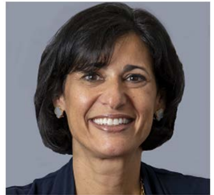
CDC Director Rochelle Walensky, MD, MPH

Registration is open from February 9-16. Read the CDC Director's letter to learn more about the forum and register at: https://www.cdc.gov/coronavirus/2019-ncov/vaccines/forum/index.html .