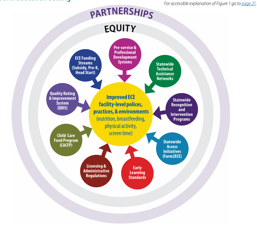
Figure 1. The Spectrum of Opportunities Framework for State-Level Obesity Prevention in the Early Care and Education Setting

To help states and communities support ECE providers to meet these national standards, CDC developed The Spectrum of Opportunities Framework for State-Level Obesity Prevention in the Early Care and Education Setting (<u>Spectrum of Opportunities</u>).<sup>2</sup> This framework was updated in 2018 (Figure 1) and is supported by an action guide.<sup>3</sup> It identifies how states can embed healthy growth and obesity prevention into their ECE systems, with an emphasis on partnerships and equity.