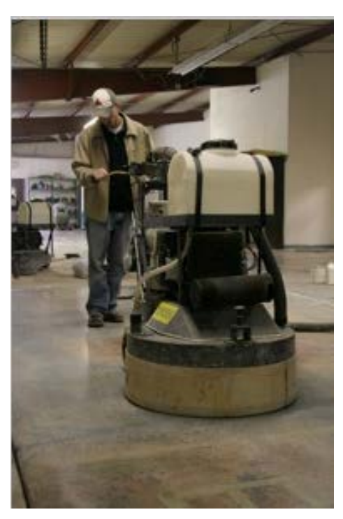
Figure 2: Floor polishing tool with water control

Many walk-behind concrete surfacing tools are sold by the manufacturers with dust controls as original equipment (Figure 2). Other dust controls are offered as after-market options. However, there is little research available that demonstrates that either the original equipment or after-market controls are effective in limiting worker exposures to respirable dust or respirable crystalline silica. Flanagan et al. [2003] reported that seven of nine samples collected during concrete floor sanding exceeded the ACGIH® TLV® for respirable quartz (at that time 0.05 mg/m<sup>3</sup>, identical to the 10-hour TWA NIOSH REL; however, since then the current TLV® has been reduced to 0.025 mg/m³). The geometric mean and geometric standard deviation for those nine quartz samples were 0.07 mg/m<sup>3</sup> and 2.62 mg/m<sup>3</sup>, respectively. These exposures demonstrate the need to identify effective dust controls for walk-behind concrete surfacing tools to reduce silica exposures among workers using these tools.