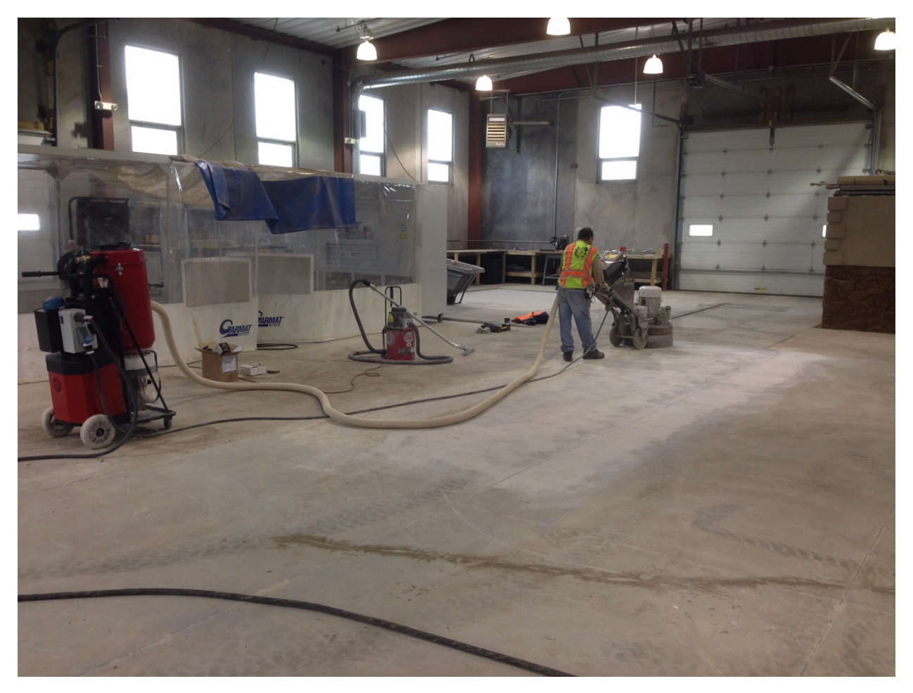
Figure 3: Polishing area with control technology

The evaluated concrete polisher was a Prep-Master 2420 manufactured by Substrate Technology Inc. (STI). The Prep-Master 2420 was connected to a vacuum system that provided local exhaust ventilation to remove the dust generated during the process. Four rotating wheels have provisions to accommodate 12 polishing disks and rotated between 250 and 750 revolutions per minute (rpm). This STI concrete polisher weighs approximately 1000 pounds, and according to the manufacturer's specifications, it is capable of removing 86 square meters (m²) (925 ft²) of concrete material per hour [STI 2015]. The physical dimensions of the polisher are 1.90 m L x 0.69 m W x 1.27 m H (75 in L x 27 in W x 50 in H).