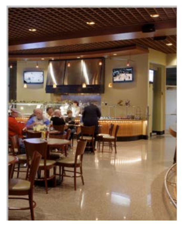
Figure 1: A polished concrete floor

Crystalline silica is a constituent of several materials commonly used in construction, including brick, block, and concrete. Many construction tasks have been associated with overexposure to dust containing crystalline silica [Chisholm 1999, Flanagan et al. 2003, Rappaport et al. 2003, Woskie et al. 2002]. Among these tasks are tuckpointing, concrete cutting, concrete grinding, abrasive blasting, and road milling [Nash and Williams 2000, Thorpe et al. 1999, Akbar-Khanzadeh and Brillhart 2002, Glindmeyer and Hammad 1988, Linch 2002, Rappaport et al. 2003]. Colored, stained, and polished concrete floors are increasingly popular for use in homes, offices, retail establishments, schools, and other commercial and industrial settings. For example, a major chain store has specified integrally-colored concrete floors in its new stores in place of vinyl composite tile. Polished concrete floors are durable, sanitary, and easy to maintain (Figure 1).