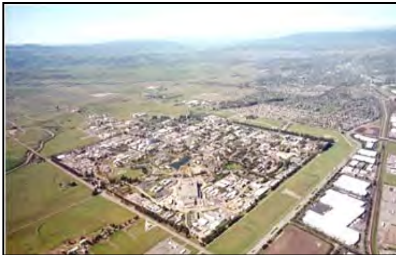
Figure 2-1. Aerial view of LLNL main site (LLNL 2005a).

LLNL was founded in 1952 on the site of a closed U.S. Naval Air Station. It was known originally as the University of California Radiation Laboratory at Livermore then later as the Lawrence Radiation Laboratory at Livermore. LLNL consists of two sites, the main Laboratory site, which is in a densely populated 1.5-mi 2 area in Livermore, California (Figure 2-1), and the 11-mi 2 Explosive Test Site near Tracy, California, which is also known as Site 300.