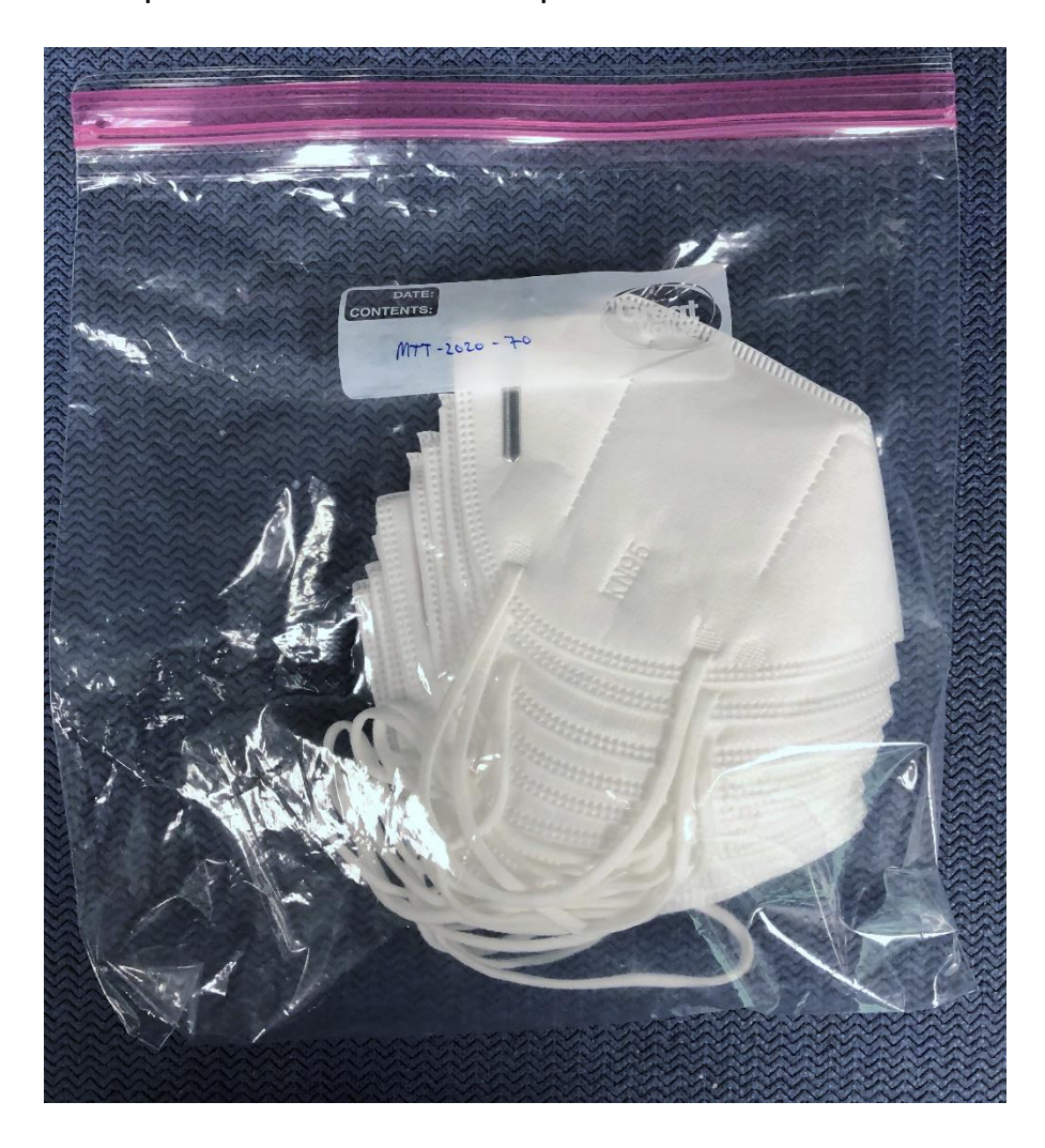
NPPTL COVID-19 Response: International Respirator Assessment