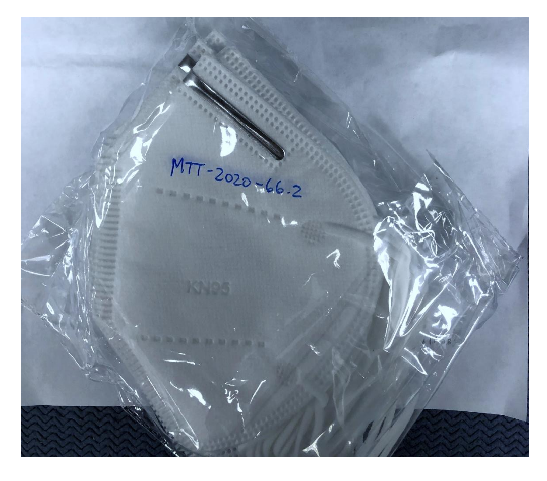
NPPTL COVID-19 Response: International Respirator Assessment