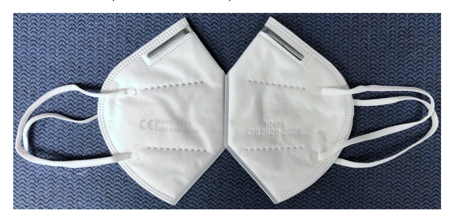
NPPTL COVID-19 Response: International Respirator Assessment