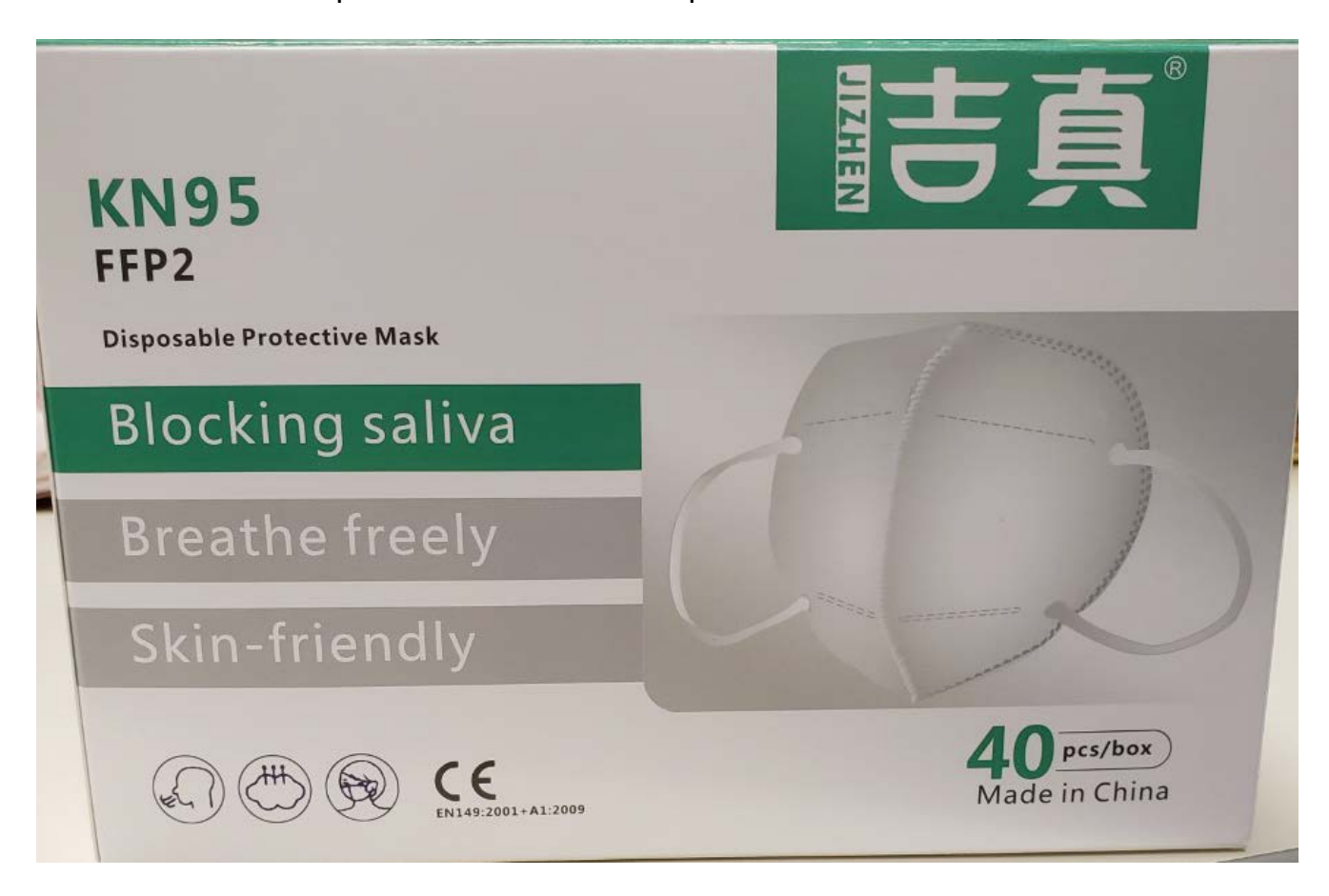
NPPTL COVID-19 Response: International Respirator Assessment