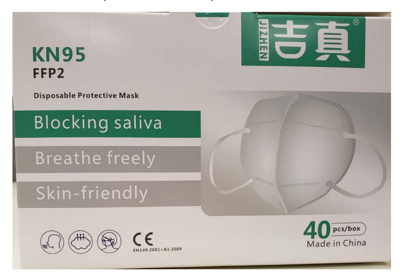
NPPTL COVID-19 Response: International Respirator Assessment