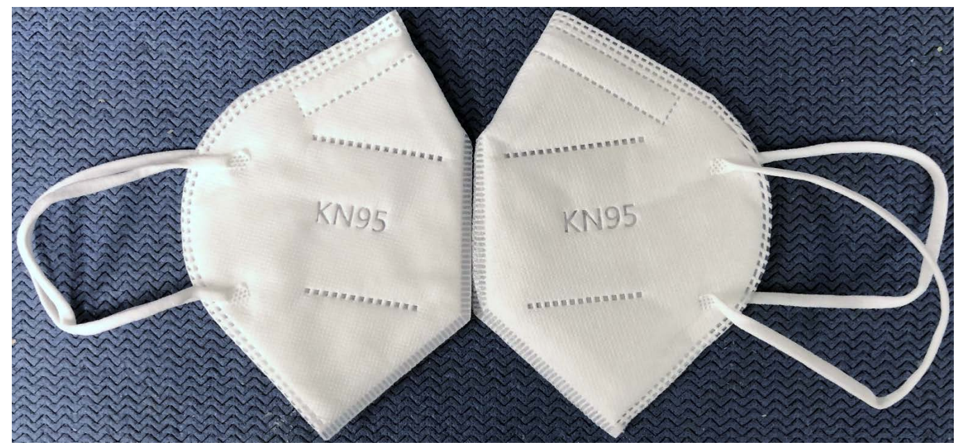
NPPTL COVID-19 Response: International Respirator Assessment