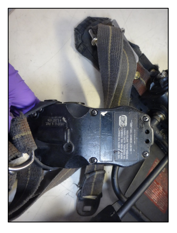
Figure 15: SEI label on back of PASS control console, 2007 edition