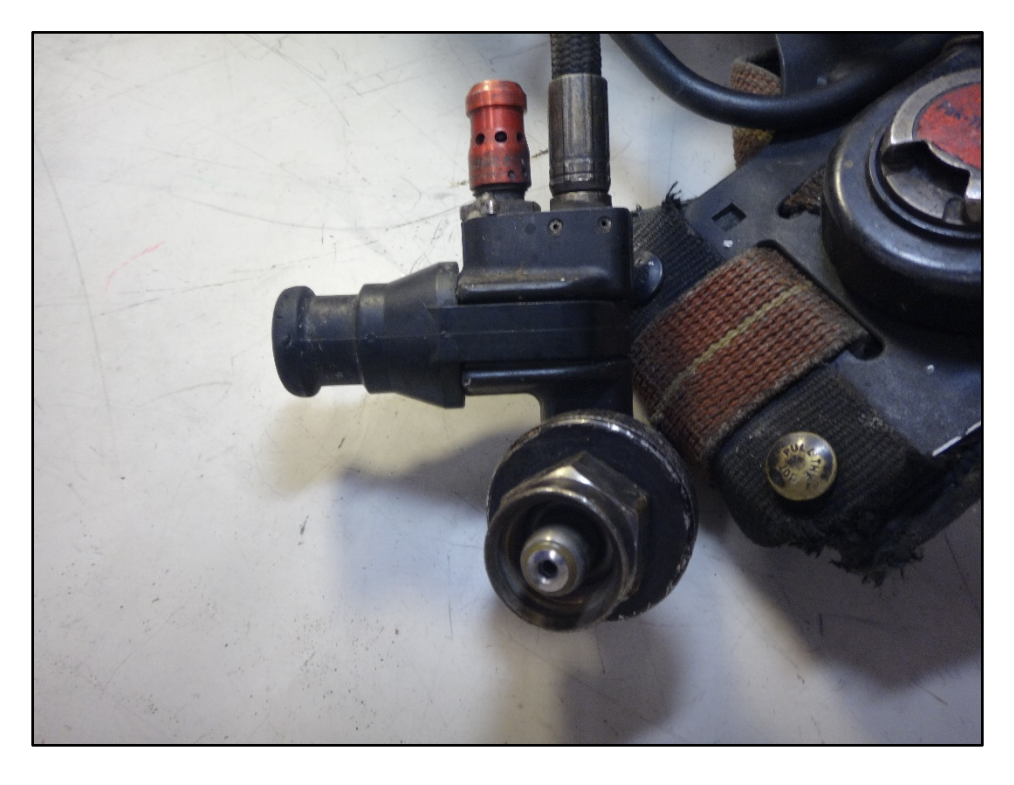
Figure 11: Cylinder attachment and RIC UAC connector