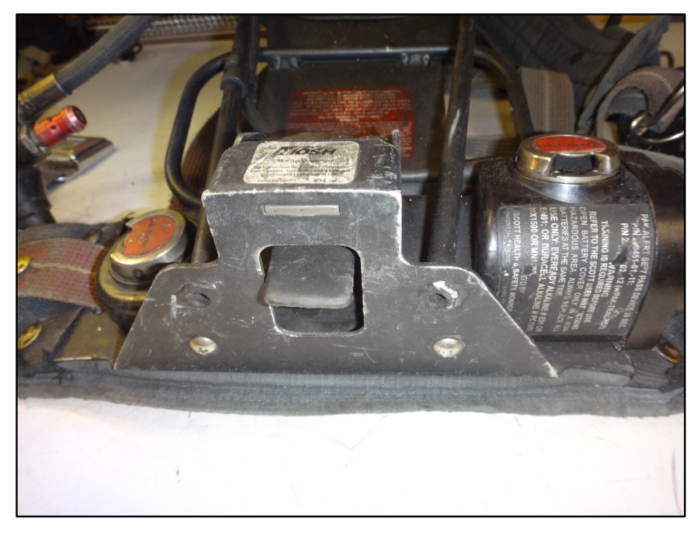
Figure 17: PASS Control module label