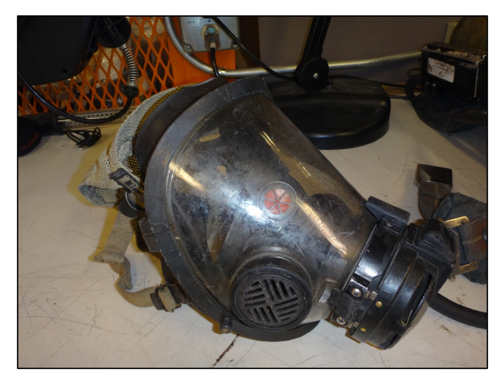
Figure 3: Front of facepiece