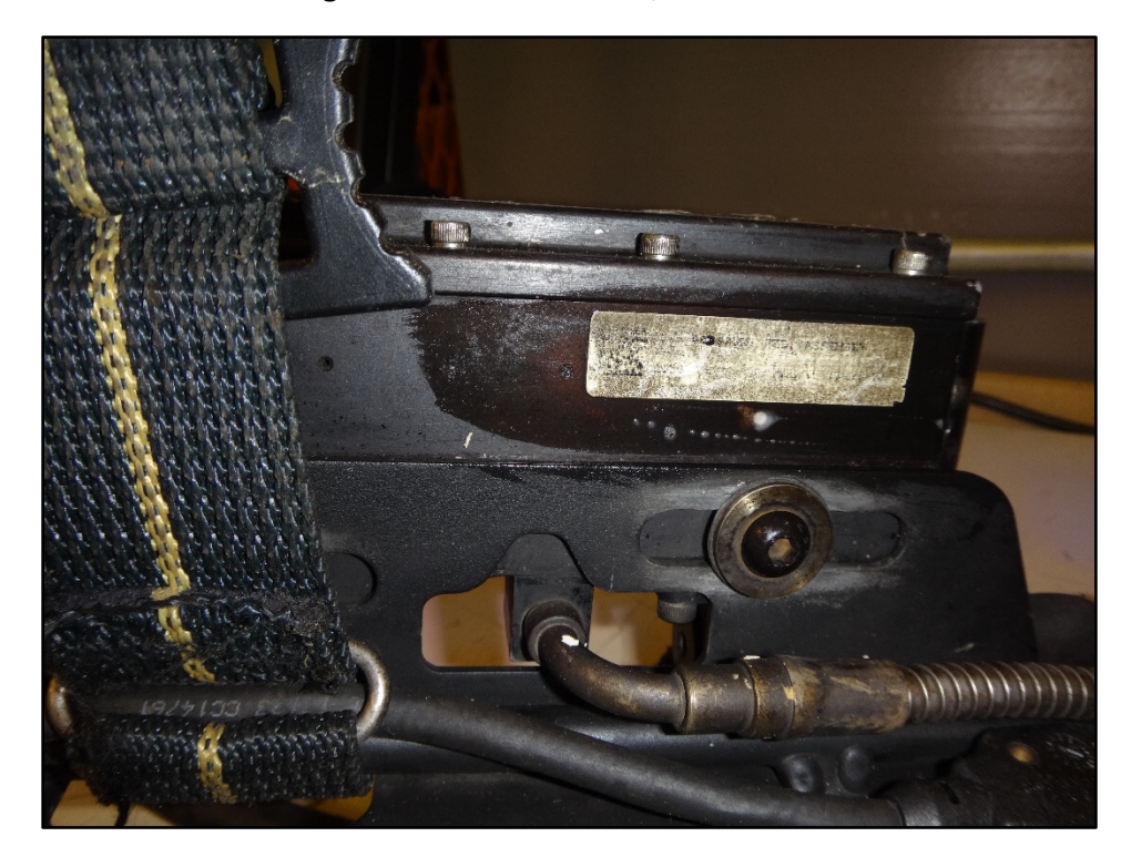
Figure 10: Pressure reducer, inside view