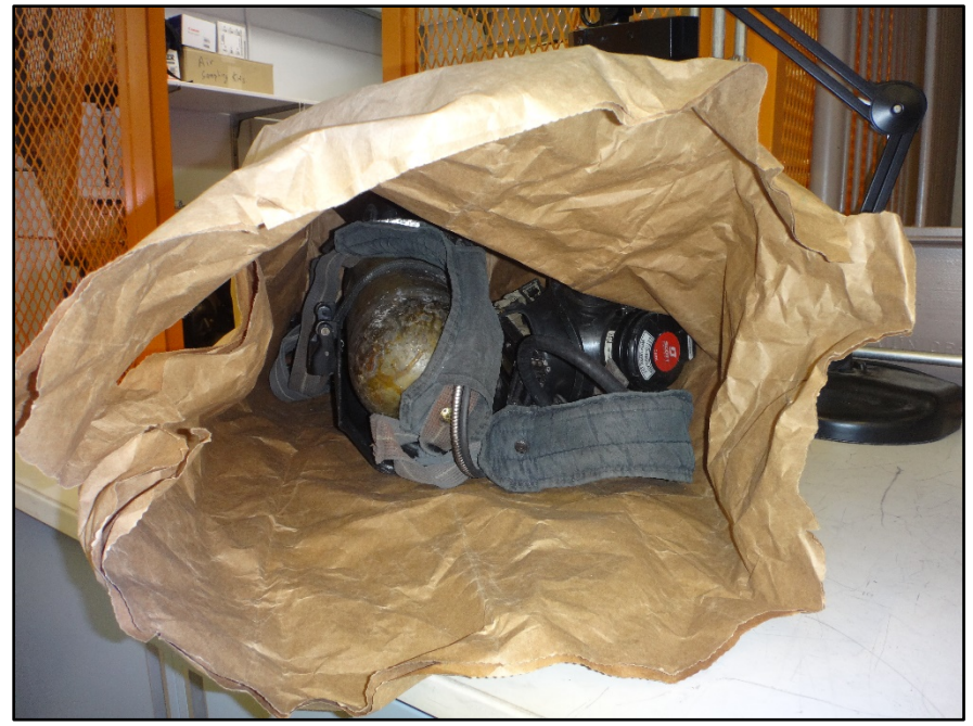
Figure 2: SCBA as received