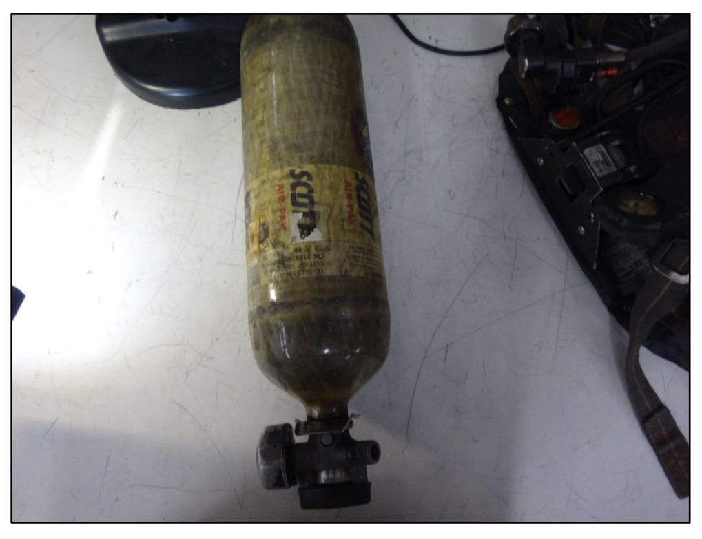
Figure 21: Overall of cylinder