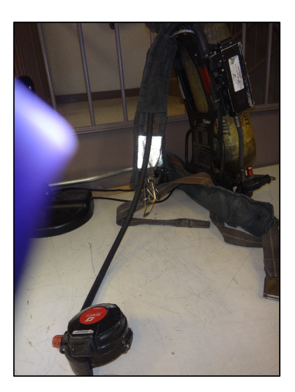
Figure 8: Low-pressure hose through shoulder strap TN-24967 New Haven, Connecticut Fire Department – Status Investigation Report