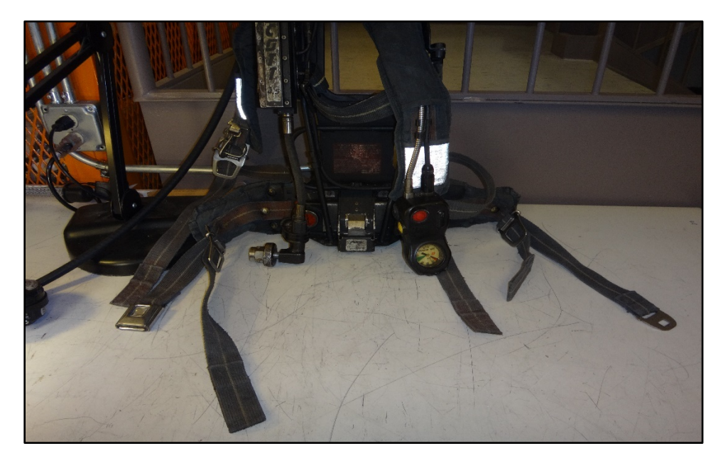
Figure 20: Overall of straps and buckles