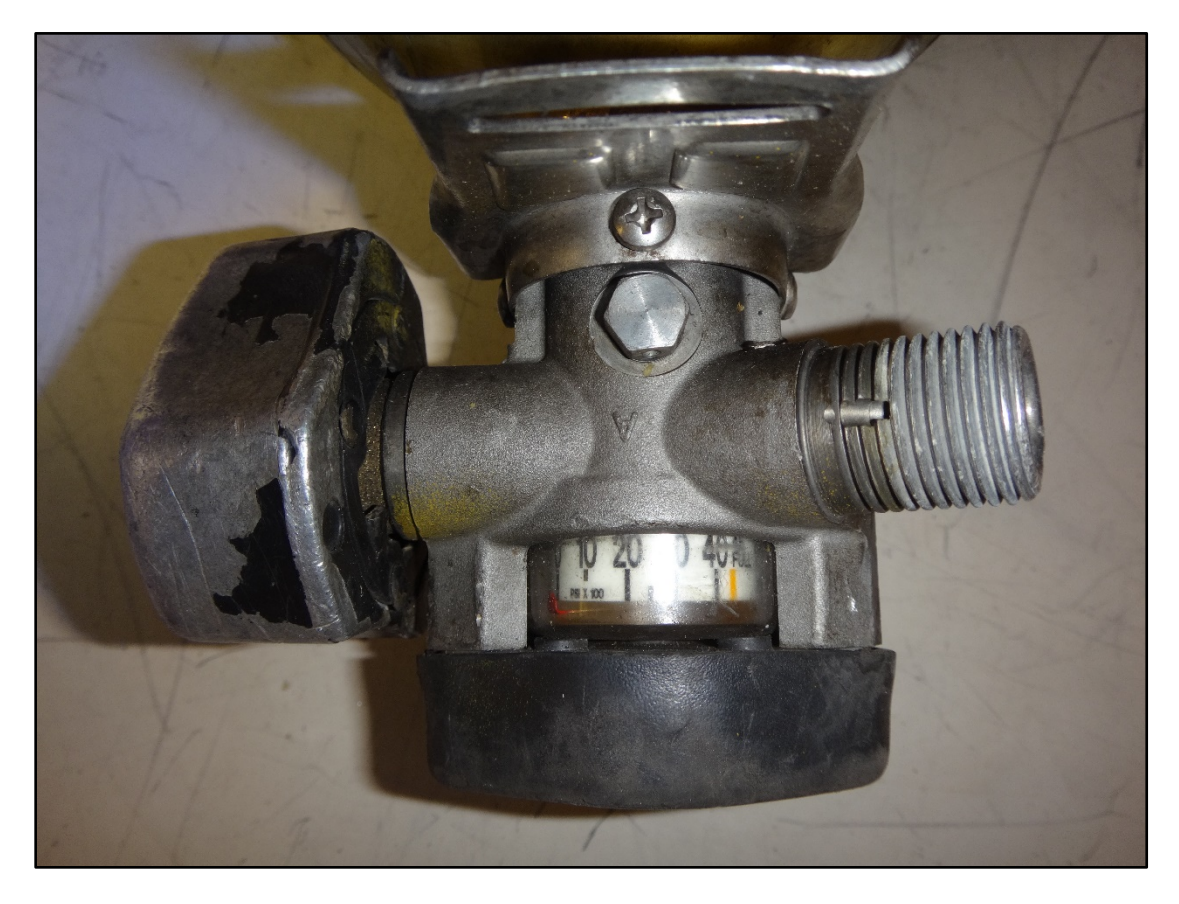
Figure 23: Cylinder valve assembly.