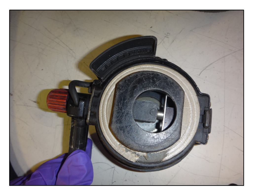
Figure 6: Inside seal of mask-mounted regulator and HUDTN-24967 New Haven, Connecticut Fire Department – Status Investigation Report