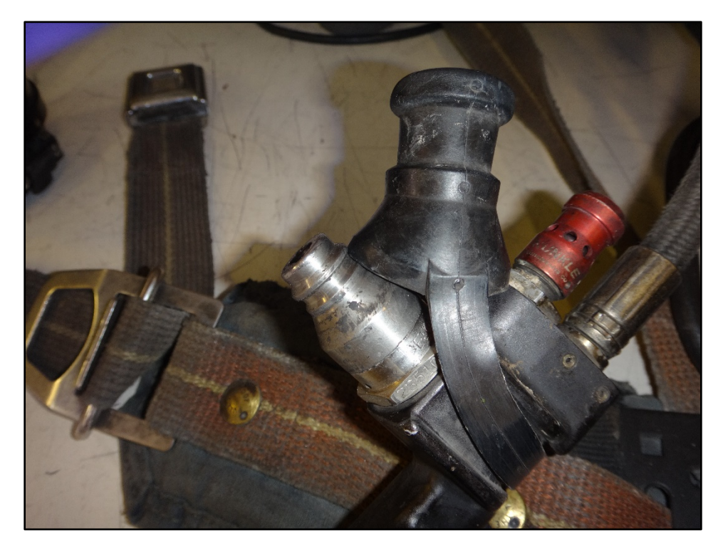
Figure 12: RIC UAC dust cover removed