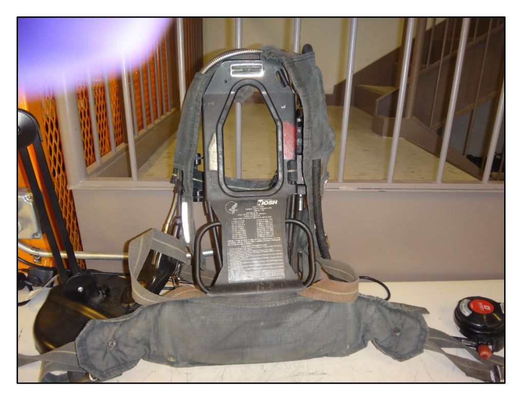
Figure 19: NIOSH label on backframe