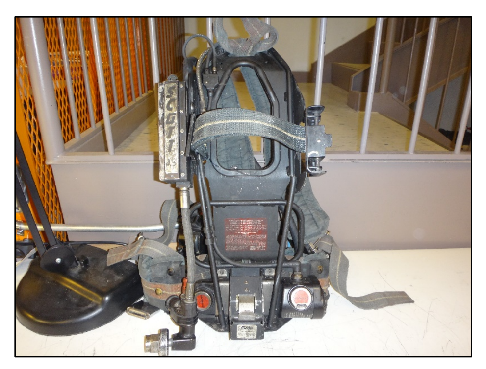
Figure 18: Overall of backframe, SEI label