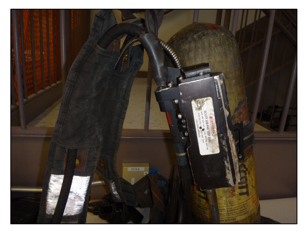
Figure 9: Pressure reducer, outside view