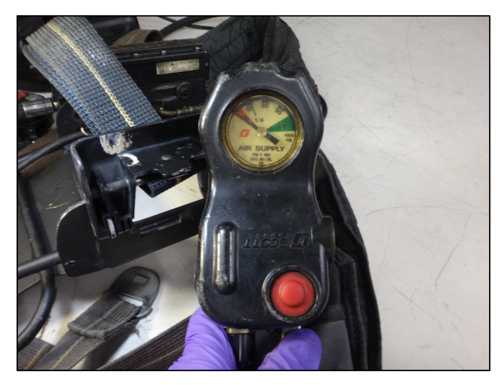
Figure 14: PASS control console