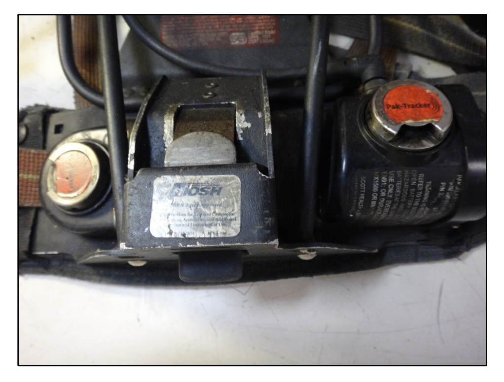
Figure 16: PASS control module under cylinder attachment and CBRN sticker on backframe