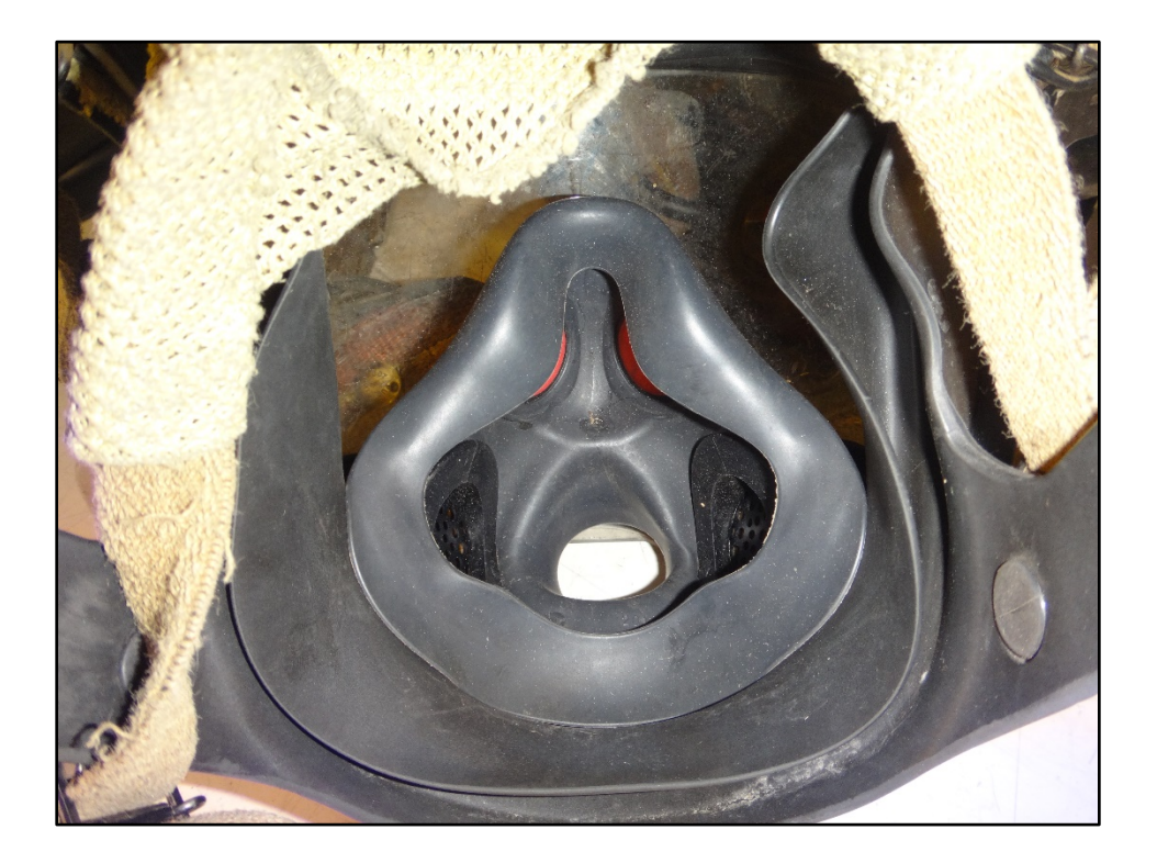
Figure 4: Inside of facepiece