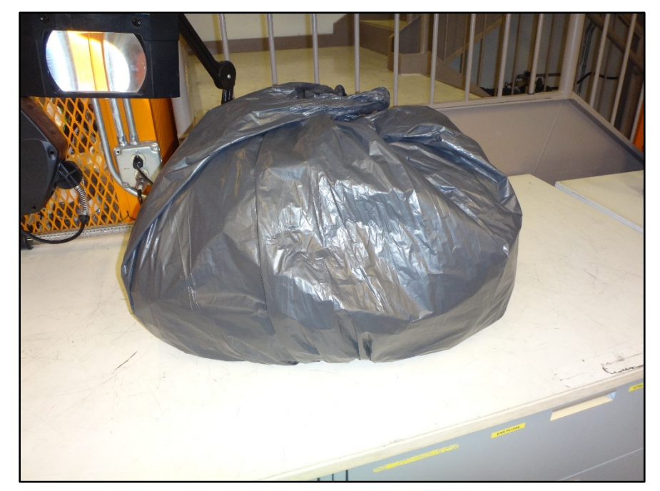
Figure 1: SCBA as received.