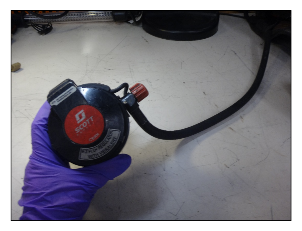
Figure 7: Low-pressure hose