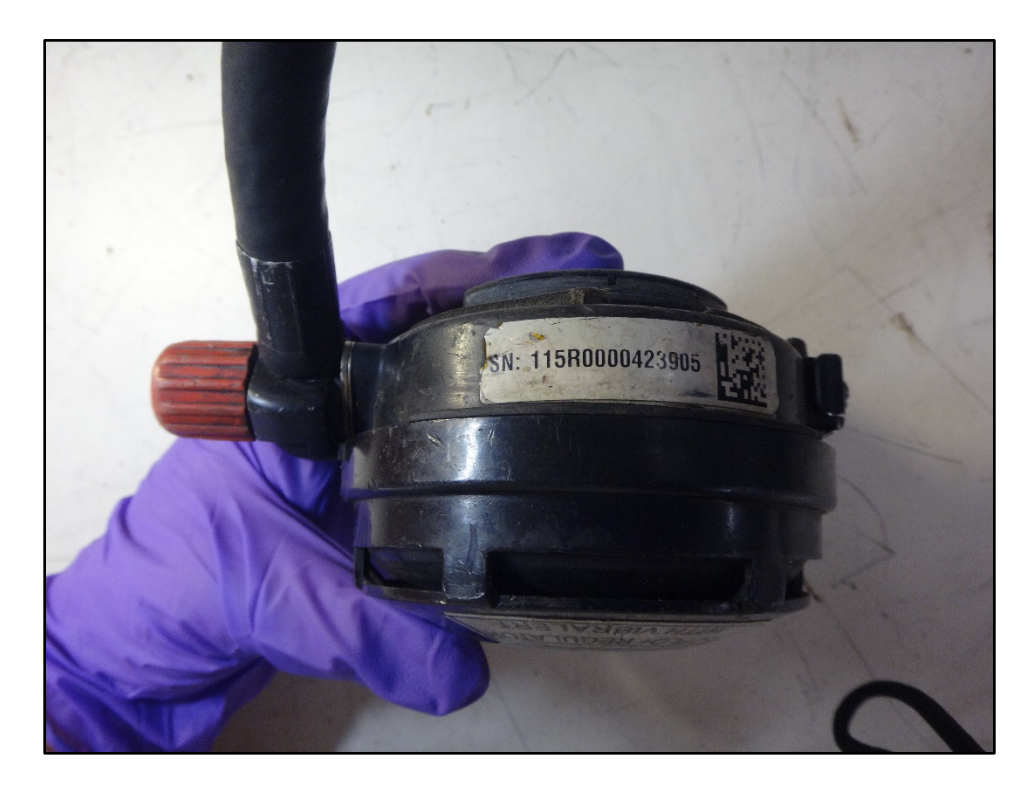
Figure 5: Mask-mounted regulator