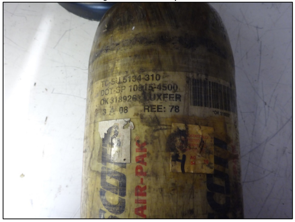
Figure 22: Cylinder label and rehydro label