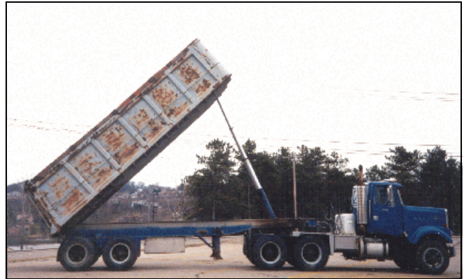
Fig. 2. 20.9 tonne (23 short ton) tractor-trailer dump truck used in experiments.

2) On the trucks, a shunt was placed from the dump bed to the truck frame, and on the cranes, between the base section of the boom and the main boom pivot supports on the turntable. Except as noted in results, the shunt was a 91 cm (36 in) piece of #2/0 AWG stranded copper cable, with clean, tight mechanical connections using C-clamps.