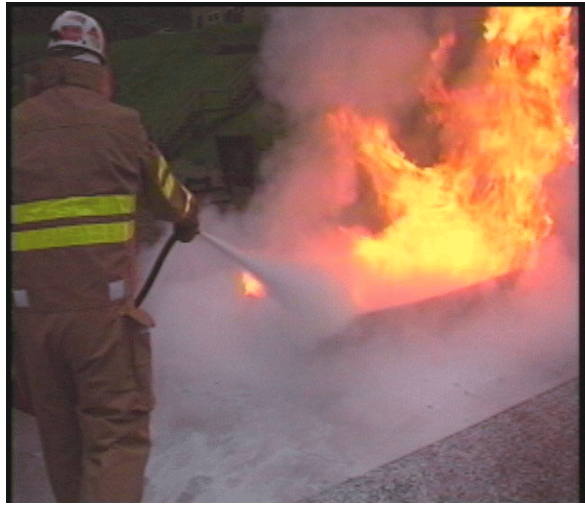
Figure 2. Extinguishment of a liquid fuel fire with dry chemical.

An important element to consider in any fire safety program is adequate hands-on training for all miners. This is the key link, and a few dollars spent now for training may prevent larger economic losses due to an out-of-control fire. Miners cannot gain effective experience by talking about using a fire extinguisher, watching a video or observing someone else extinguishing a fire. In general, mines have a lot of in-house fire fighting expertise (mine rescue, fire brigades, volunteer firefighters) and these personnel can be utilized to develop an