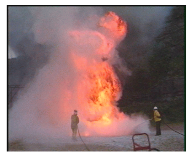
Figure 3 . Extinguishing a 37.2 m<sup>2</sup> liquid fuel fire.

Improved training can be an effective means of bringing about a reduction in the number of fire incidents. Mine fire training (8) can be divided into the following three areas: a) basic training for all miners, b) intermediate training for mine fire brigades/mine rescue teams, and c) advanced training for fire brigade/mine rescue teams. A basic fire