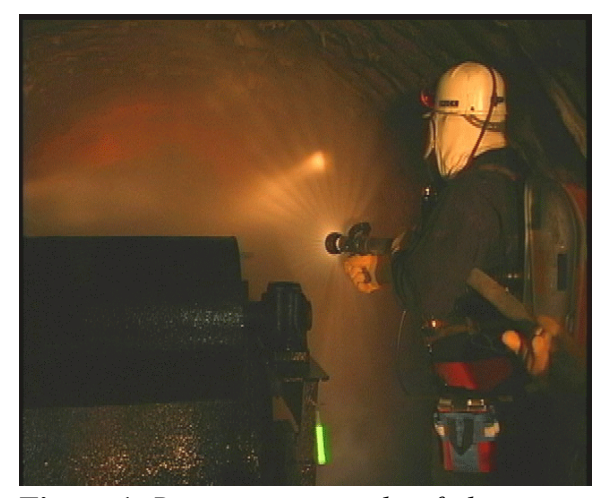
Figure 1 . Rescue team member fighting a conveyor belt fire.

Over the past several years, NIOSH's Pittsburgh Research Laboratory (PRL) has conducted mine rescue training simulations at its Lake Lynn Laboratory (LLL) and operating mines (13). Figure 1 shows rescue team members fighting a conveyor belt fire in the surface fire gallery at LLL. This training resulted in improved technology and training for mine rescue teams, fire brigades, first responders, and miners in general. For example, existing technologies were identified to help responders during exploration and recovery operations. These included various chemical light shapes, strobe lights, light vests, and laser pointers to identify team members. Most of these devices may be used to mark underground areas and certain mine materials. Strobe lights were used for mapping out escapeways and lasers were used to negotiate