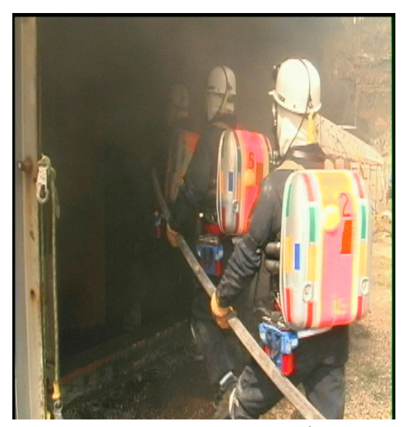
Figure 4 . Rescue team entering fire gallery .

All miners need to walk their escapeways and participate in a preplanned fire drills with nontoxic smoke. It gives the workforce an opportunity to learn from the experiences of others and provides a better understanding of how miners will react during an emergency. NIOSH conducts on-site smoke training exercises that allow the workforce to experience first hand, traveling through smoke (visibility ranging from 1 to 3-m) in their mine passageways and at the same time evaluate improved escape technologies.