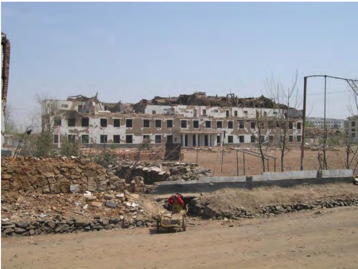
Figure 3. Ryongchon Primary School was severely damaged by the train explosion.