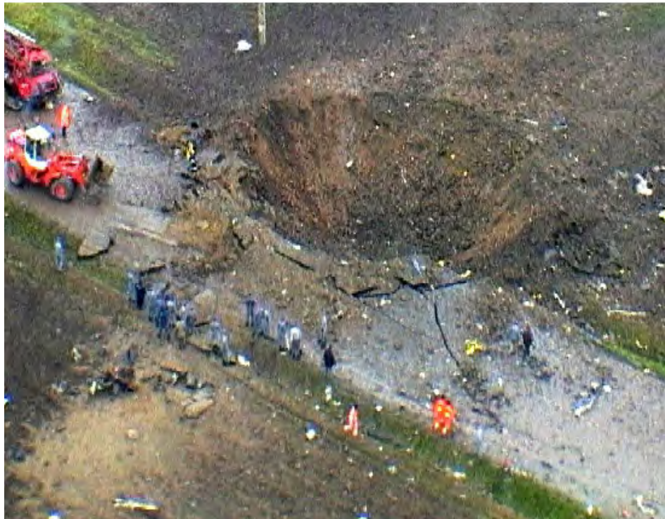
Figure 4. Accident in Romania in which 20 MT (22 t) of "nitrous fertilizer" caught fire and exploded, killing 20 people.