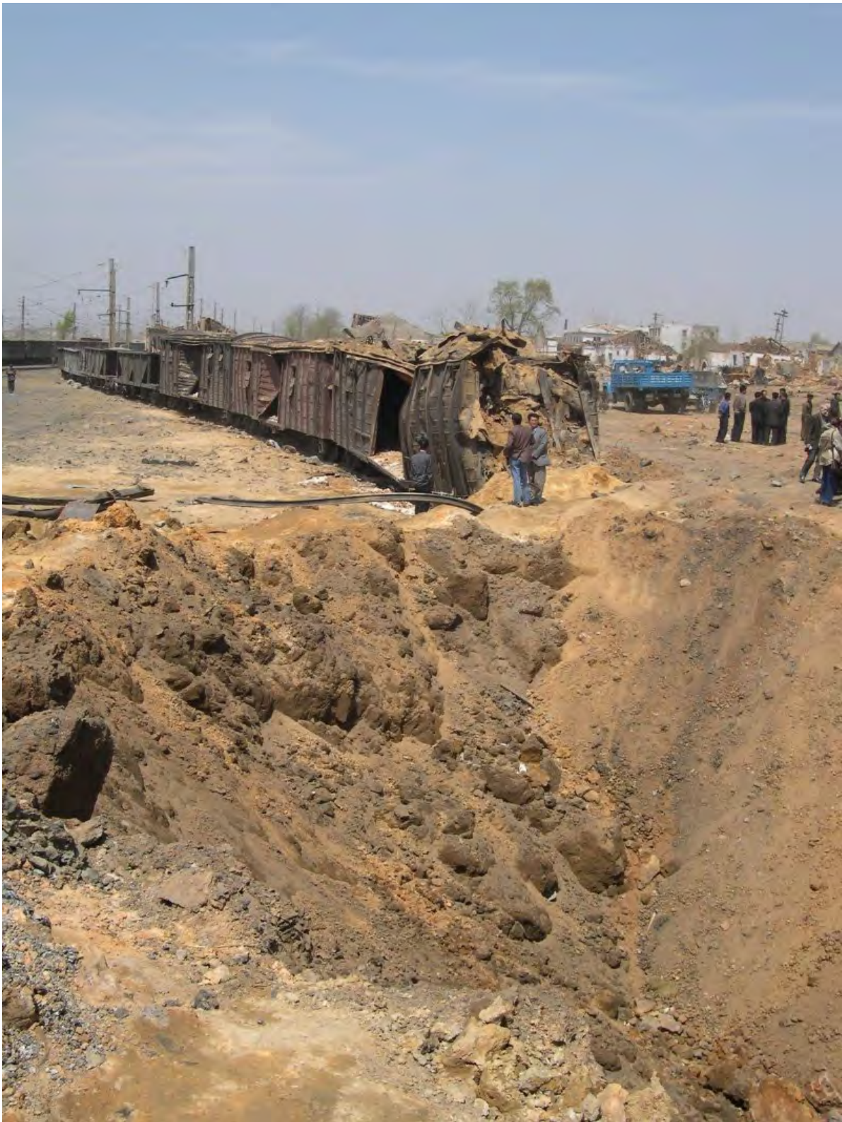
Figure 2. Crater produced by train explosion in Ryongchon, North Korea.