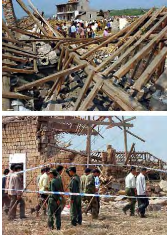
Figure 5. Damage caused by the 2005 explosion of an 18-MT (19.5-t) truckload of AN in Zhenganzhai, China.

The accidents above all occurred outside of the U. S. Table 1 lists five industrial explosives transport accidents in the U.S. None of the U.S. accidents resulted in fatalities. (There was a fatal accident involving Division 1.3 fireworks but the authors have limited this discussion to explosives used in industrial applications.) The worst accident was the explosion of 16,102 kg (35,500 lb) of explosives along Route 6 in Utah in August, 2005 15 . The truck driver apparently lost control of the truck on a curve and the truck tipped over and caught fire. Cars stopped and passengers rescued the driver and co-driver from the truck. The driver told his rescuers that the truck was carrying explosives. People were in the process of moving everyone away from the accident scene when the truck exploded. The explosion produced a crater 9 m (30 ft) deep and 21 m (70 ft) wide. The driver and co-driver were hospitalized. Seventeen others were injured but most were not serious; two were hospitalized. The response to this accident was consistent with the guidelines in USDOT ERG; people were evacuating the accident site as quickly as possible.