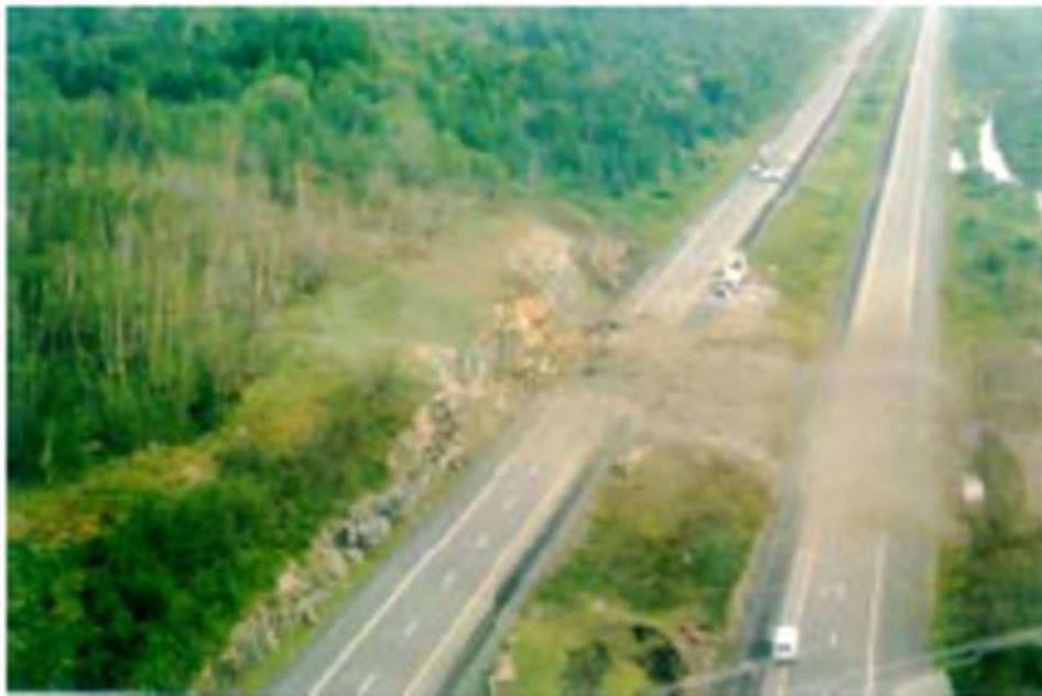
Figure 1. Site of explosives truck accident in Walden, Ontario.

On August 5, 1998 an explosives truck consisting of a tractor and trailer carrying 18,000 kg (40,000 lb) of blasting explosives went off the road near Walden, Ontario, Canada 5,6,7 . A fire started immediately. Drivers passing by stopped and helped the driver exit the truck and took him to safety. Explosive placards and the driver's warning alerted people to the hazard and they evacuated the site. The truck exploded about 35 minutes after the accident. The explosion caused two minor injuries, threw fragments of the truck up to 2,740 m (5,800 ft), and damaged several houses. At the time the truck exploded firefighters were in contact with the Canadian Transport Emergency Centre (CANUTEC) and were advised against approaching the scene. Evacuation of the accident site prevented any fatalities or serious injuries. The accident scene is shown in Figure 1.