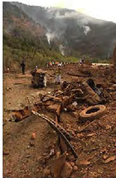
Remains of truck