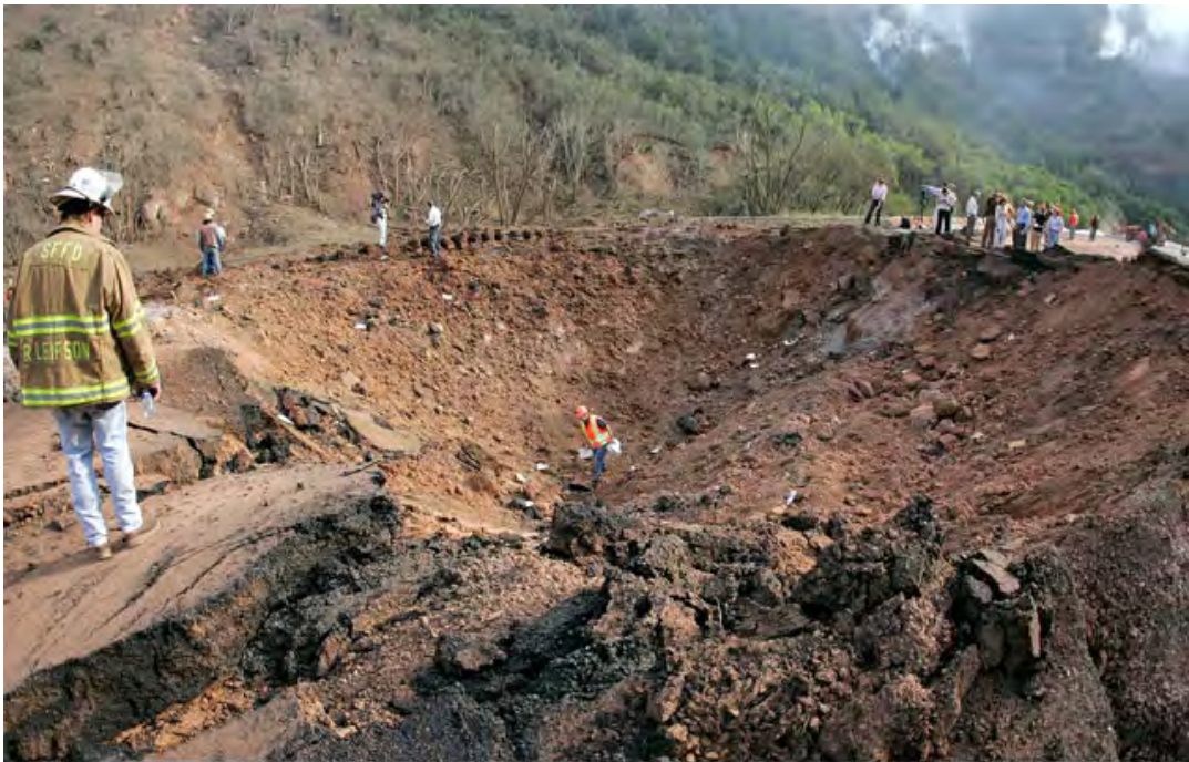
Crater, 20-35 feet deep