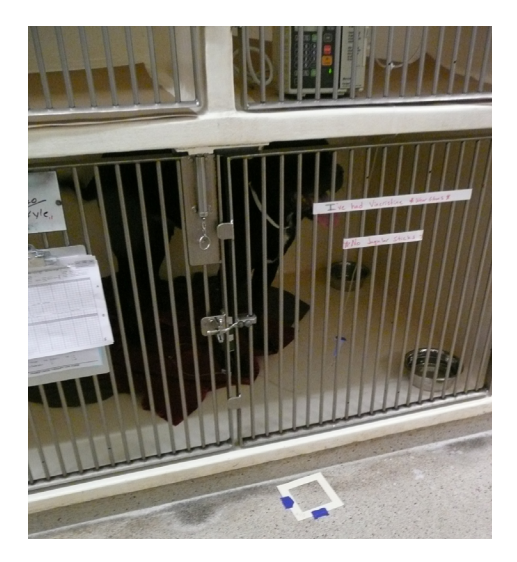
Figure 3. A chemotherapy drugtreated canine in a labeled kennel. The label warned employees of potential chemotherapy drug cross contamination and identified the chemotherapy drug used.

a procedure that required at least two employees or students to restrain the animals for IV catheter placement and drug administration. Animals were placed on the treatment table and prepared by shaving and disinfecting the area where the IV catheter was placed. The administering technician then injected the chemotherapy drug. Figure 2 illustrates a chemotherapy drug injection process.