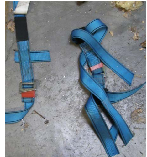
Harness cut from laborer

When the victim moved aside, he stepped onto two pieces of rotten plywood that were not nailed down, and the plywood pieces and unattached joist supporting them gave way. An investigation determined that his rope grab was attached near the end of his lifeline which left too much slack in the line allowing him to fall 30 feet to a concrete floor.