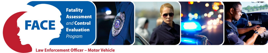
Law Enforcement Officer – Motor Vehicle