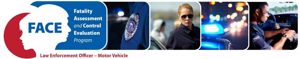
Law Enforcement Officer – Motor Vehicle