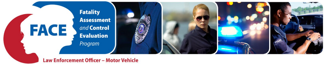
Law Enforcement Officer – Motor Vehicle