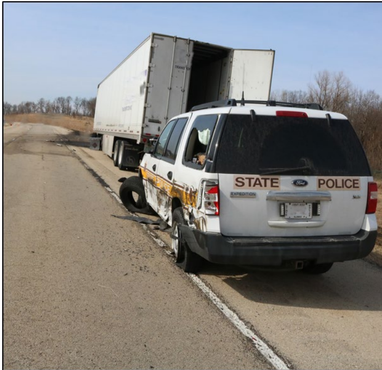
Photo of the Trooper's vehicle along with the commercial motor vehicle after the fatal incident.