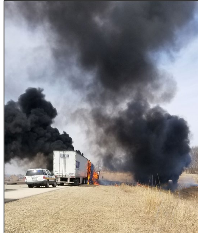
Photo of commercial vehicles on fire at the scene after the impact.