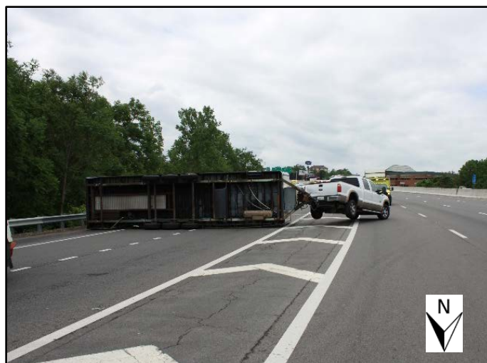
Photo 1. Initial incident the officers responded to, looking southbound in the northbound lanes.

Patrol Unit B also moved south, blocking lane three and parking parallel to Help Truck B. The emergency lights were activated on Patrol Unit B in a right-to-left directional pattern consistent with the help truck arrow board; the Help Truck B operator repositioned the cones to block lanes three and four, behind both of the vehicles. Officer B exited his vehicle to speak to the Help Truck B operator. The Help Truck B operator advised Officer B he had another help truck on the way to assist with traffic control.