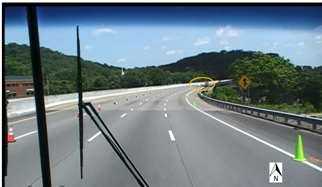
Photo 2. Recreation of motorist visibility; 900 feet south of crash site.

The investigator used mathematical computations to determine if the motorist should have been able to see the patrol unit and help truck, perceive the situation, and stop within 900 feet.