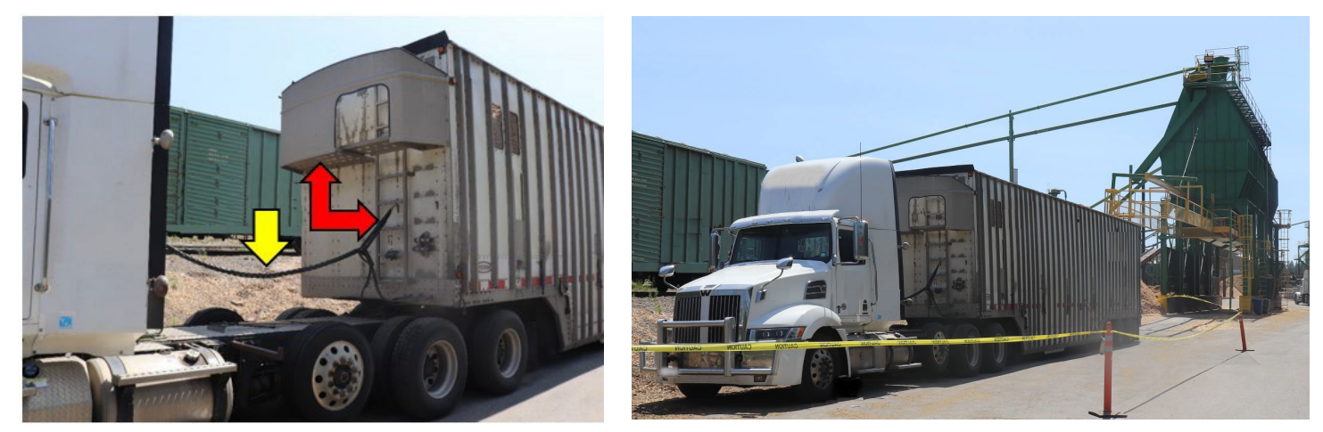
Photos 11 and 12: Red arrows in left photo show front trailer fall protection platform and ladder that driver ran toward while on top of the load at the back of the trailer when rollaway ocurred. Yellow arrow shows the trailer's air and electrical supply lines suspended between the tractor to the trailer. Right photo shows truck's approximate stop location after it rolled away down the paved road's 2% grade.