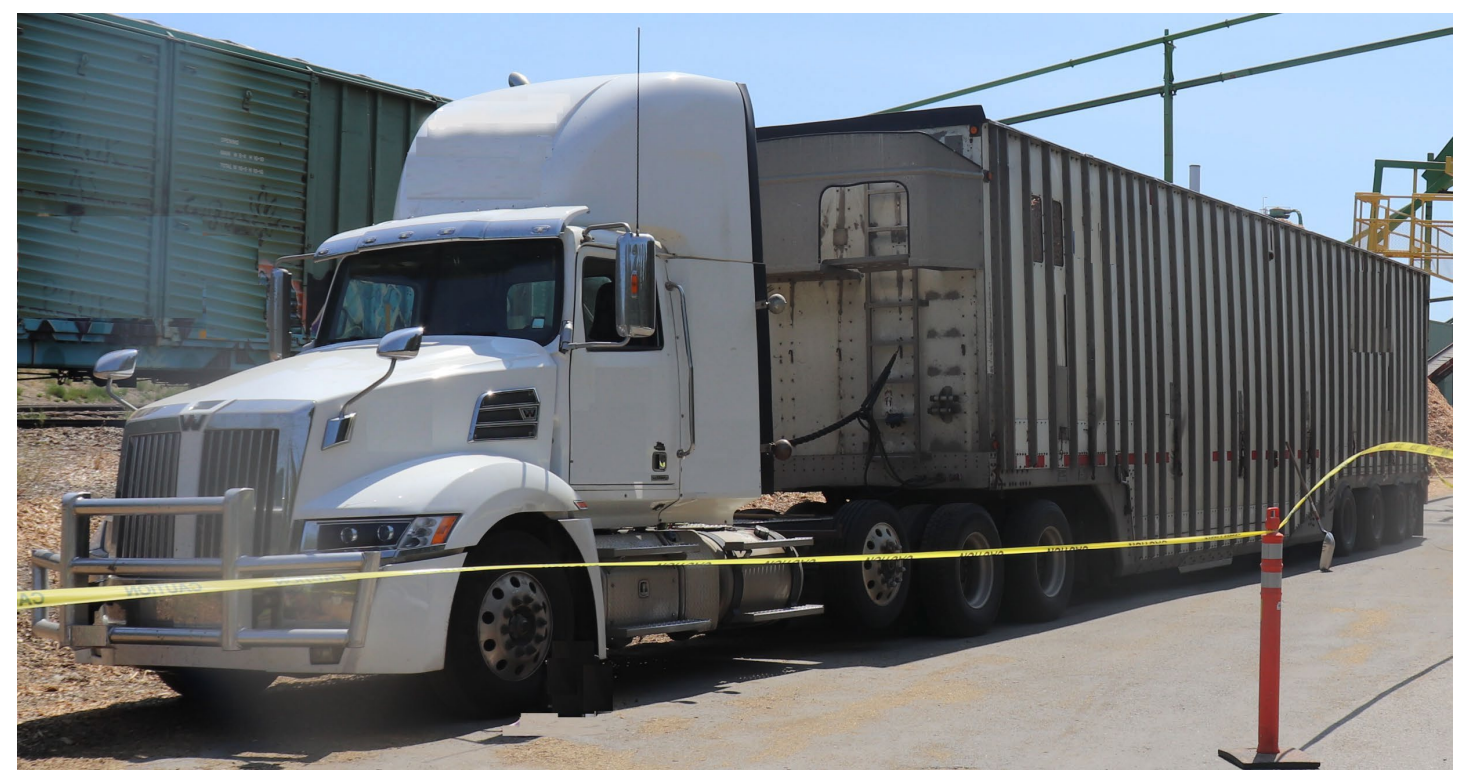
Photo 1: The fatally injured driver operated this 2016 Western Star semi-tractor with a 2004 TYCROP highcube, quad-axle, possum belly Super B-train chip trailer.

at the front. Driving hazards included the risk of collisions and rollovers, while performing job tasks on and around the truck entailed the risk of struck by incidents, crushing, strains and sprains, and slips, trips, and falls.