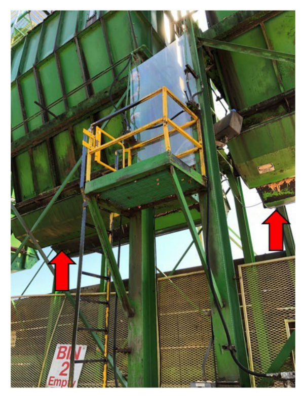
Photo 9: Bin control platform with ladder that truck drivers used to access hydraulic levers for bottom gates that released woodchips into the trailer. Arrows point to the gates.

The truck passed the tarping station and bulk storage bins on its left and made a wide left U-turn to align itself with the south end entrance to the bins (Photo 4). The truck stopped for 20 seconds until the only other truck in the area, which was parked at the end of the tarping station road ahead, exited the property. The driver was now alone in the area. He drove his truck slowly under the bins and parked it when the back half of its trailer was below the second bin at the far end. It is not known if he had set his parking brake under the bins. He then exited the cab, walked to the bin control platform ladder, and climbed up to use the hydraulic levers for the bottom gates that released woodchips into his trailer (Photo 9). After the back of his trailer was loaded, the driver returned to his truck and reversed it to level the load and position the front half of the trailer under the first bin behind him. The driver parked the truck and went back to the bin controls to finish loading the trailer.