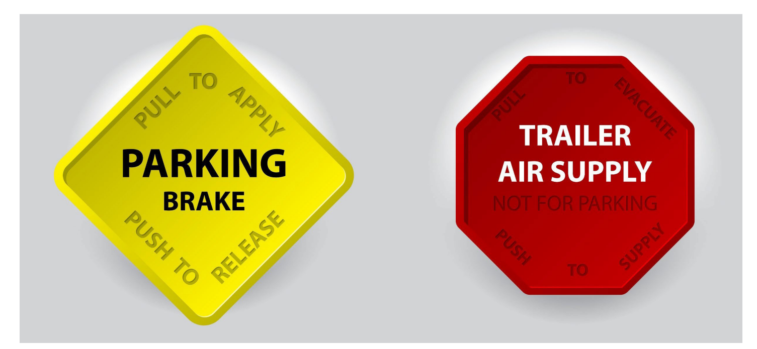
Photo 2: Industry standard push-pull air brake valve control knobs that are installed on semi-truck cab dashboards.

Washington FACE • PO Box 44330 • Olympia, WA 98504-4330 1-888-66-SHARP (toll-free) or 360-902-5667