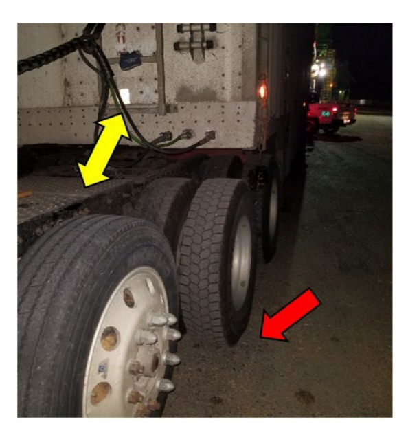
Photo 13: Red arrow in top left photo shows approximately where the driver's body was found crushed under the chip truck's left front drive wheels. Yellow arrows show base of front trailer ladder and walkway between cab and trailer that the driver attempted to access as his truck rolled.

Washington FACE • PO Box 44330 • Olympia, WA 98504-4330 1-888-66-SHARP (toll-free) or 360-902-5667