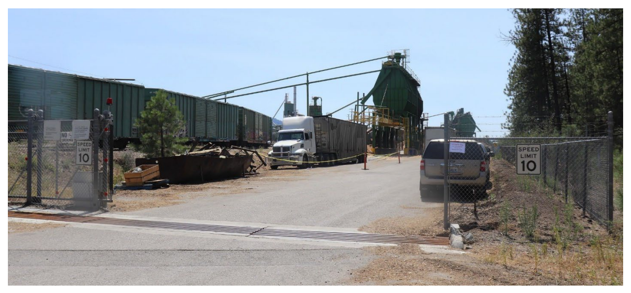
Photo 8: View looking south at road through sawmill entrance's security gate. Incident truck is parked on left with the fall protection tarping station and bulk woodchip storage bins behind it

The truck entered the woodchip loading area after entering the sawmill southward through a fenced security gate near the property's northern boundary (Photo 8). Both sides of the gate had red plastic reflectors and private property, no smoking, and 10 mph speed limit signs posted. The paved road into the area was bordered by freight railroad tracks on the left and a small stand of pine trees on the right. Woodchip debris were scattered on the road surface. The fall protection tarping station and elevated bulk storage bins were situated about 110 feet from the entrance on the left side of the road. The road and loading areas were lit by truck headlights and spotlights mounted on various structures. The truck's tractor and trailer lights were on at all times. A security camera located south of the area monitored and recorded truck traffic.