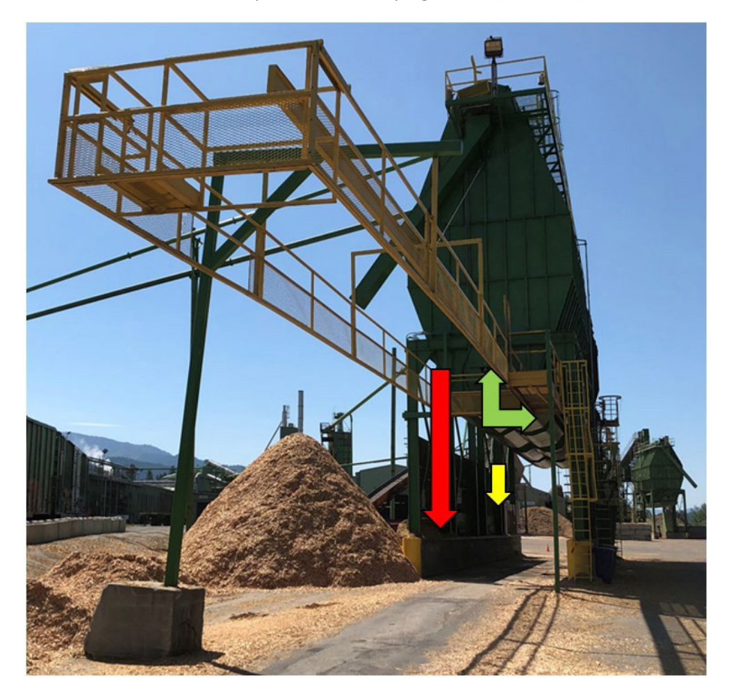
Photo 10: Red arrow shows where the back of the fatally injured driver's trailer was laligned under the back of the tarping station above. Green arrows show the ladder and platform that allowed the driver to access the rear top of his trailer. Yellow arrow shows where the front of the second truck's tractor was located under the bins when the incident occurred. Approximately 30 feet of space separated the trucks. The paved road under the tarping station had a 2% downgrade toward the exit in the foreground.

returned to his truck, drove it forward until the trailer was under the adjoining fall protection tarping station, and parked on the station's paved road, which had a 2% downgrade toward the exit. The second truck then pulled forward and parked the front of its trailer under the first bin. This left approximately 30 feet of space between the front of the second truck and back of the first truck now parked at the tarping station (Photo 10).