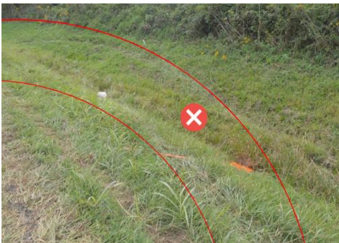
Photo 14. Photo depicting location where victim was struck (red X) and the path of the vehicle prior to and after striking the victim (red lines).