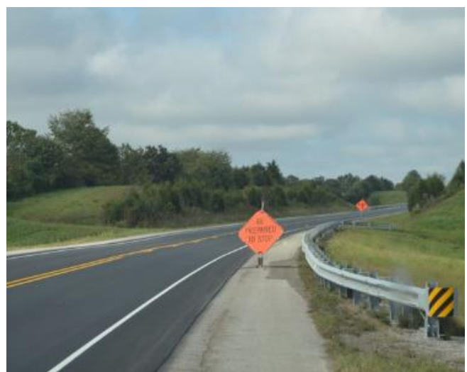
Photo 8. Photo showing sixth work zone sign present as you approach the scene of the incident traveling east. Sign reads, "BE PREPARED TO STOP."