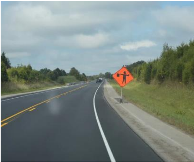
Photo 9. Photo showing seventh work zone sign present as you approach the scene of the incident traveling east. Sign depicts flagger ahead.

Kentucky Injury Prevention and Research Center Bona fide agent for Kentucky Department for Public Health 333 Waller Avenue, Suite 242 • Lexington, KY 40504 • 859-257-5839