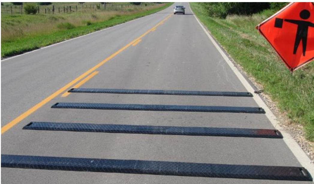
Photo 17. Photo of portable temporary rumble strips in use.

As a best practice and additional safeguard, employers should utilize portable temporary rumble strips, when possible, in work zones.