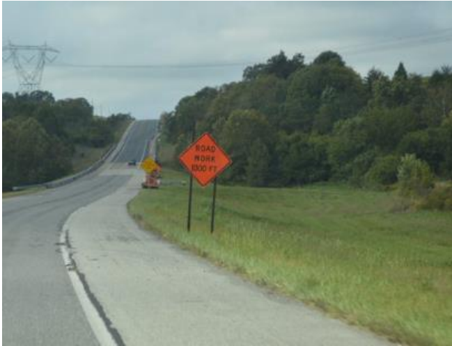
Photo 5. Photo showing third work zone sign present as you approach the scene of the incident traveling east. Sign reads, "ROAD WORK 1000 FT."

Kentucky Injury Prevention and Research Center Bona fide agent for Kentucky Department for Public Health 333 Waller Avenue, Suite 242 • Lexington, KY 40504 • 859-257-5839