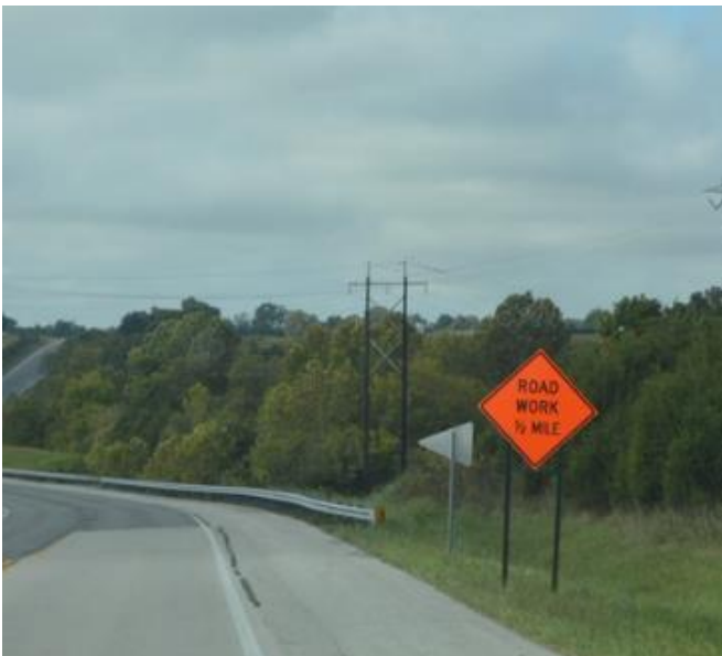
Photo 3. Photo showing first work zone sign present as you approach the scene of the incident traveling east. Sign reads, "ROAD WORK 1/2 MILE."