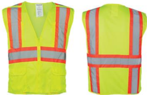
Photo 10. Photo depicting an ANSI Class 2 safety vest.

At 8:30 a.m., after work had been active for approximately 30 minutes, a Chevrolet pickup truck traveling east approached the work zone but failed to stop, as instructed by the victim. Approximately 18 feet prior to the victim's location, the driver of the pickup truck made an evasive maneuver and steered to the right, attempting to avoid the flagman (victim) (photo 12). Simultaneously, the victim fled to his left toward the ditch to escape the approaching vehicle (photo 13). The vehicle traveled approximately 21 feet after leaving the eastbound lane of travel, across the shoulder of the highway and into the ditch, striking the victim approximately 3 feet off the paved shoulder (photo 14). According to the involved company, the impact resulted in the victim being thrown to the ground. The involved vehicle continued forward, driving over the victim and out of the ditch, steering the truck back onto the travel portion of the highway. Once back on the highway, the involved vehicle proceeded to make a U-turn and flee the scene of the incident, heading west. A motorist traveling west witnessed the events unfold and contacted emergency medical services, who arrived on scene approximately 15 minutes later at 8:45 am. The victim was transported to a local hospital, where he succumbed to his injuries.