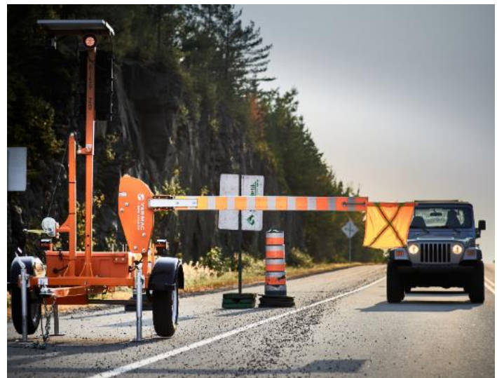
Photo 16. Photo of AFAD in use.

Recommendation #2: Stationary law enforcement vehicles with activated blue lights in work zones should be utilized when workers are present.