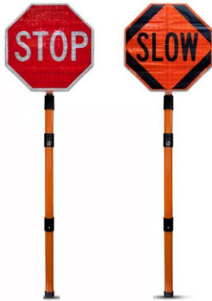
Photo 12. Stock photo of STOP/SLOW wand utilized by flaggers.

Kentucky Injury Prevention and Research Center Bona fide agent for Kentucky Department for Public Health 333 Waller Avenue, Suite 242 • Lexington, KY 40504 • 859-257-5839