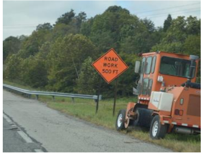
Photo 6. Photo showing fourth work zone sign present as you approach the scene of the incident traveling east. Sign reads, "ROAD WORK 500 FT."