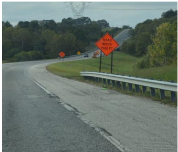
Photo 4. Photo showing second work zone sign present as you approach the scene of the incident traveling east. Sign reads, "ROAD WORK 1500 FT."