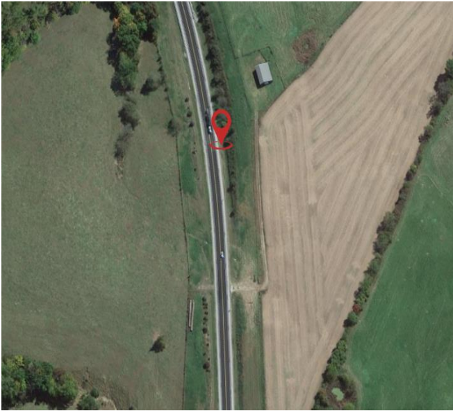
Photo 1. Overhead Google Earth image showing location where the incident occurred.

Kentucky Injury Prevention and Research Center Bona fide agent for Kentucky Department for Public Health 333 Waller Avenue, Suite 242 • Lexington, KY 40504 • 859-257-5839