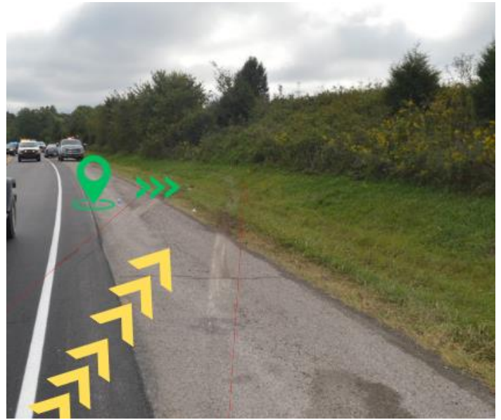
Photo 13. Photo depicting continued path of vehicle after leaving the east travel lanes (yellow arrows) and the escape route taken by the victim (green location marker and arrows).