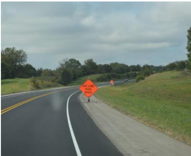
Photo 7. Photo showing fifth work zone sign present as you approach the scene of the incident traveling east. Sign reads, "ONE LANE ROAD AHEAD."