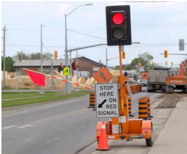
Photo 15. Photo of AFAD.

Kentucky Injury Prevention and Research Center Bona fide agent for Kentucky Department for Public Health 333 Waller Avenue, Suite 242 • Lexington, KY 40504 • 859-257-5839