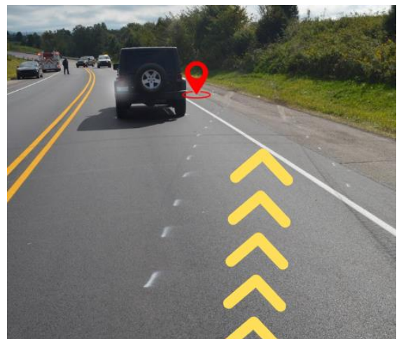
Photo 11. Photo depicting path of the involved vehicle (yellow arrows) and original position of victim (red location marker).