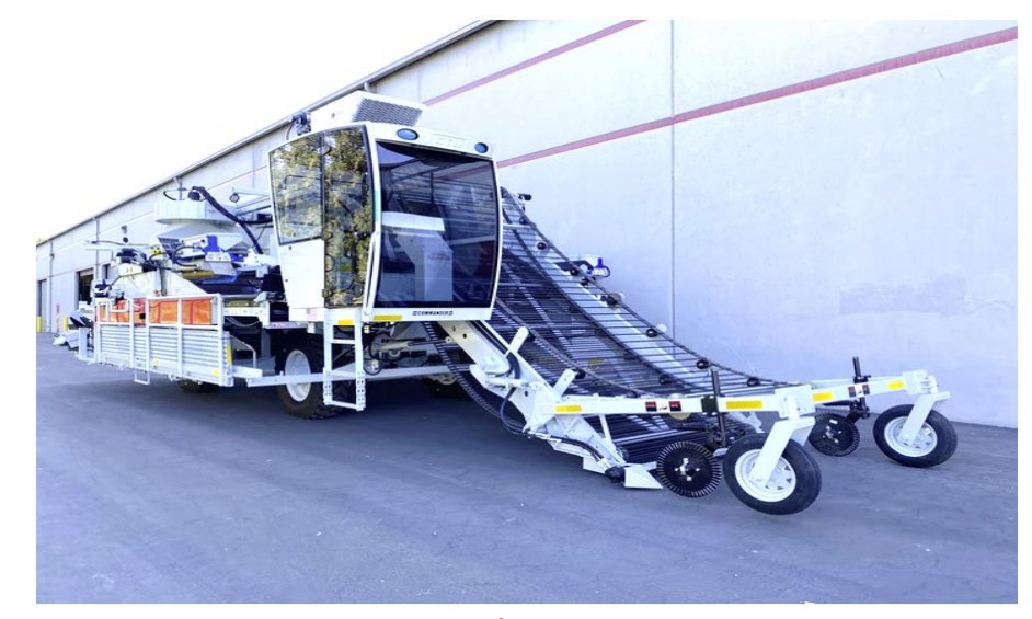
Exhibit 1. A tomato harvester machine (similar model, not actual used in incident).

The windshield on the operator cab did not have windshield wipers or a spray washer system (similar to automobiles), or side mirrors that would allow the driver to see the platforms. There was a significant blind spot on the operator's left side due to the pick-up section conveyer (known as the header chain).