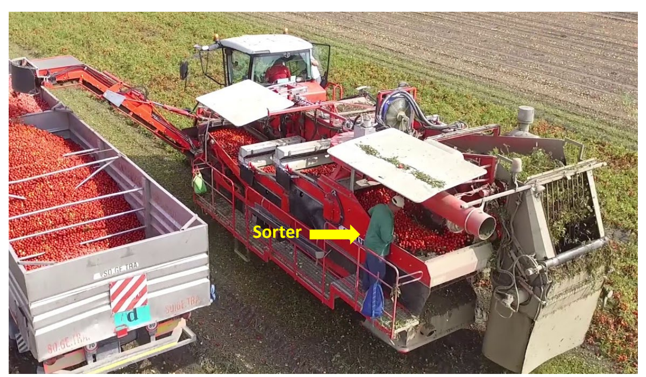
Exhibit 4. Tomato harvester showing sorter's typical position during harvesting.