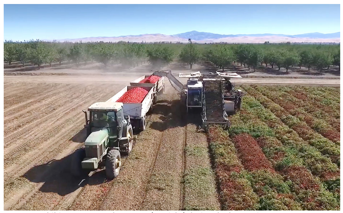
Exhibit 2. A tomato harvester (on right) during the harvesting process.