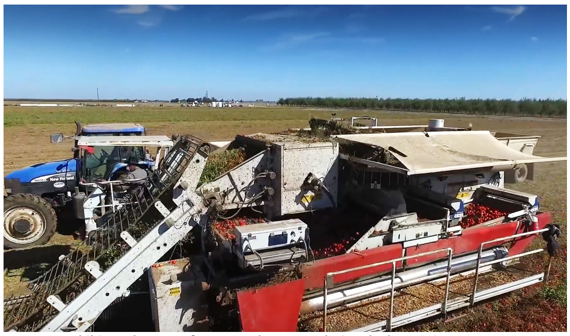
Exhibit 3. Close-up of a tomato harvester during the harvesting process.