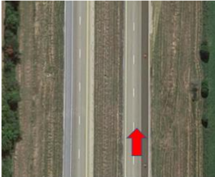
Photo 2. Google Earth image indicating the location of the crash.

Kentucky Injury Prevention and Research Center Bona fide agent for Kentucky Department for Public Health 333 Waller Avenue, Suite 242 • Lexington, KY 40504 • 859-257-5839