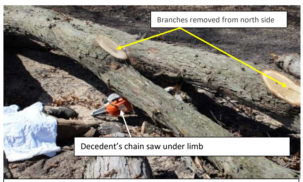
Photo 6. Close view of chainsaw location under limbs and branches removed when working from north side

Her son, who had driven his pickup truck to the site, arrived just before her and told her to keep away. He