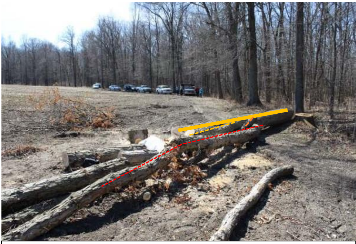
Photo 2. Incident scene, looking south. Solid yellow line is primary trunk of tree. Dotted yellow line is limb striking decedent. Red dotted line is limb that was laying on the ground. Orange dotted line is supporting limb. Trunk and other limb were oriented above the limb laying on the ground.

The decedent was described by family members as very organized, driven, and meticulous. As an example of