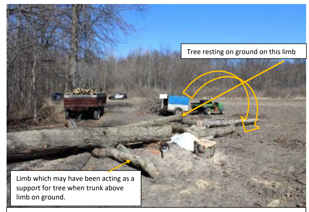
Photo 4. Incident scene looking north. Curved arrow shows direction of tree rotation, limb upon which tree was balanced.