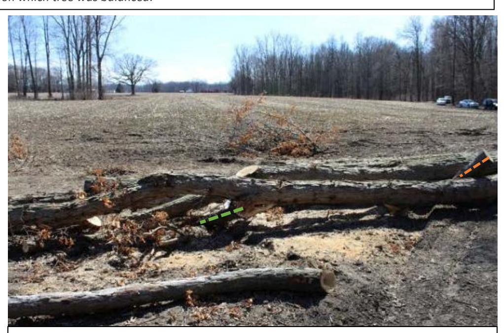
Photo 5. Looking south. Orange dotted line shows limb supporting tree. Green dotted line shows another supporting branch which broke away from the tree when it rolled to the south.