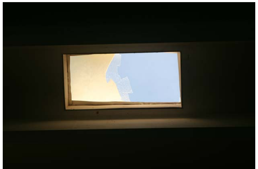
Photo 7. Incident skylight. Photo taken while standing on floor 30 feet below skylight.