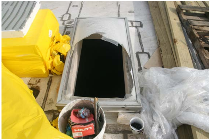
Photo 6. Skylight involved in incident