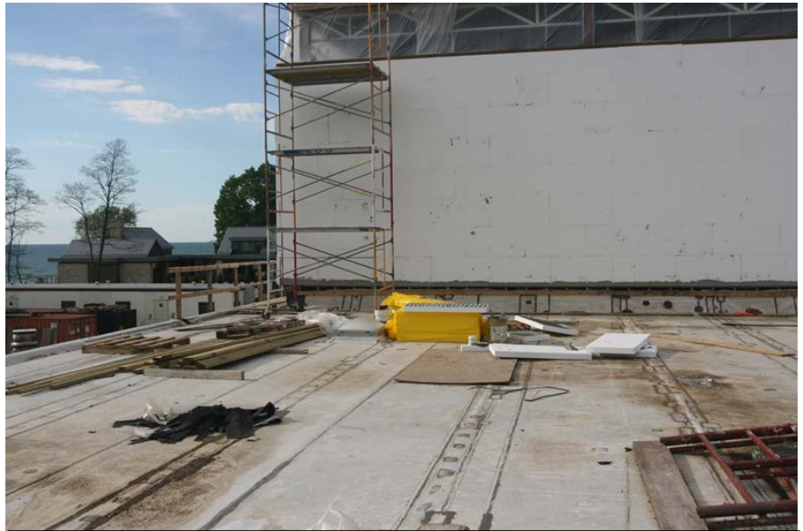
Photo 4. Incident area, looking north

The decedent and his coworker accessed the roof through a 3-foot by 3-foot wall opening on the east side of the penthouse. The decedent’s employer indicated that he was aware of the skylights and told his employees working on the roof to be careful and not break them.