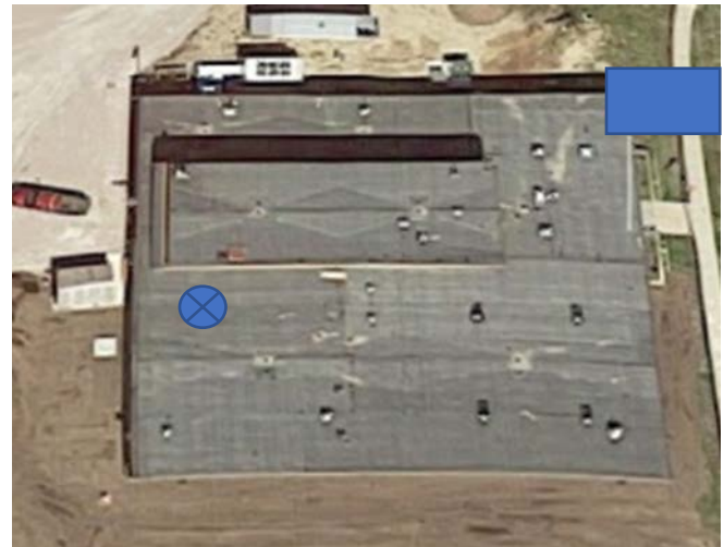
Photo 2. Water treatment plant building roof. Blue circle with X was approximate location of incident skylight.

Several skylights had previously had their covers removed and no barricade or cover had been placed around/over them. Two of the opened skylights had ventilation fans placed in them, providing air movement to the first-floor work sites (Photo 3). The decedent's employer did not know which firm removed the skylight covers.