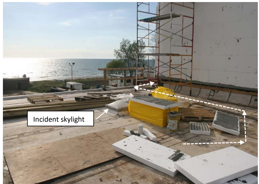
Photo 5. Incident area. Dotted lines show most likely path of decedent when he carried the prepared foam board to the owner working in the boom lift

The decedent and his coworker, who was cutting foam, were working next to the skylight through which the decedent fell. The decedent was mudding the foam board near the west side of the roof at the east side of the skylight involved in the incident. The firm owner, elevated in a boom truck owned by Firm 2, was positioned on the southwest corner of the penthouse applying the prepared foam. After mudding the foam board, the decedent walked approximately 8-