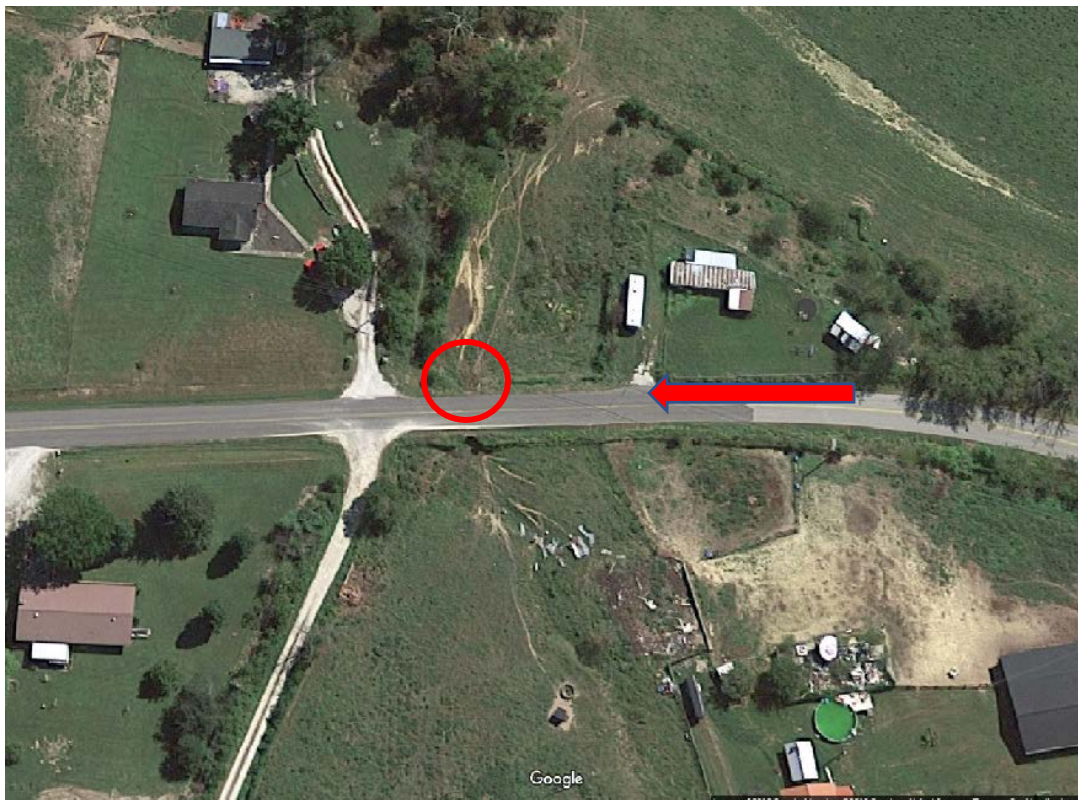
Photo 3: Aerial view of crash site. Circled area shows final resting spot of the overturned truck. Arrow shows direction of travel