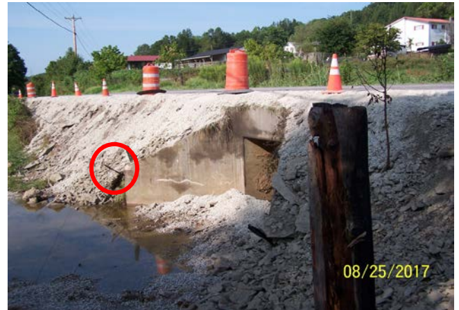
Photo 2: Rebar that the fuel tank struck.