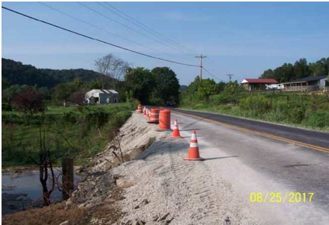
Photo 1: Embankment at the crash site. Barrels and cones added post-incident.

Kentucky Injury Prevention and Research Center Bona fide agent for Kentucky Department for Public Health 333 Waller Avenue, Suite 242 • Lexington, KY 40504 • 859-257-5839