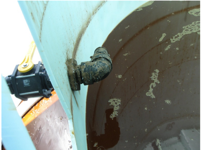
Figure 2: Valve used to pump out contents of tank. Molasses and water mixture remaining in tank can be seen to right of photo.

On the day of the incident, the decedent arrived at work and attended a planning meeting for the day's operations. At the meeting, it was discussed that one of the molasses tanks needed to be emptied and refilled with water to prepare the tank to be recycled. The decedent and one coworker were assigned to drain the tank. The tank was located outside of the main building for the business, grouped with two other similarly large tanks and several smaller tanks and containers on a concrete pad. Beginning around 10:00 AM, the workers diluted the remaining molasses with an approximately equal volume of water, creating a mixture that was 5-6 feet deep. The workers then connected a gasoline-powered pump to a valve near the bottom of the exterior of the tank and began pumping out the molasses-water mixture.